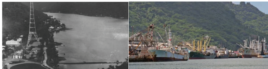
Figure 4 The changes in Pago Pago Harbor from 1940 to present day

Since 98% of Samoans identify as a Christian denomination (2006 Census) religious beliefs also guide what is socially acceptable among