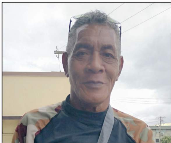
Peinuu Tali 65 tausaga o Neiafu ma Nu'u - Fou

Fa'afetai fo'i i le Malo, ona o le tofā ua a'e e fa'aāoga televise e fa'asalalau ai fa'afiafiaga ma polokalame o le Teuila o lenei tausaga, manaia lava lona, e talatalanoa lava ma le lo'omatua ma le fanau ma matamata fa'afiafiaga o le a fa'asalalauina.