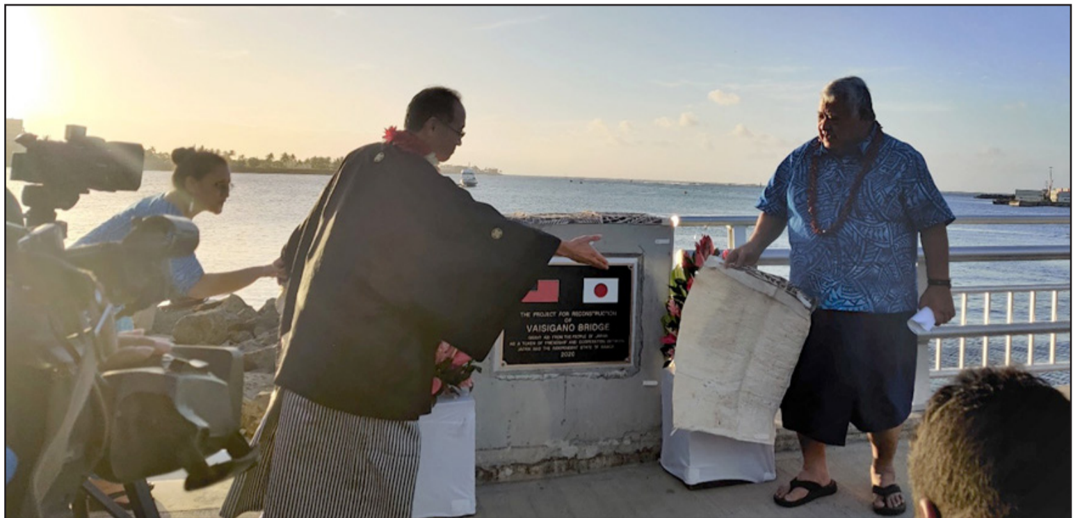
Prime Minister Tuilaepa Sailele Malielegaoi and Japan’s Ambassador Mr Genichi Terasawa unveiling the Vaisigano bridge plaque.

“The Vaisigano Bridge project not only ensured the up-skilling of national personnel but also offered employment opportunities to our workforce. As well, the construction of the new Vaisigano