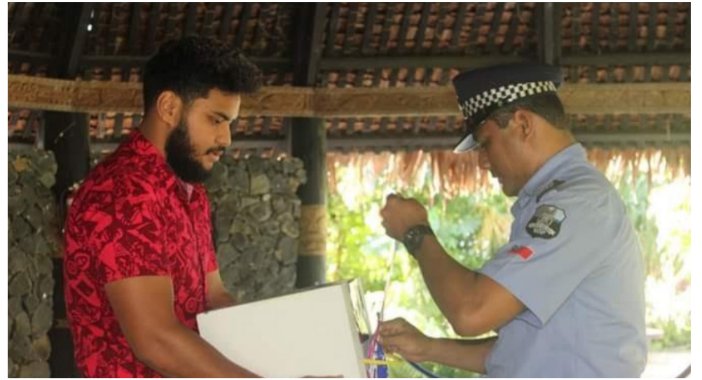
Members of the OEC during the Gagaifomauga #3 by-election over the weekend.

Meanwhile, the National Emergency Operations Center have been tasked by Cabinet to explore ways to repatriate Samoan students marooned in China, Japan and Australia.