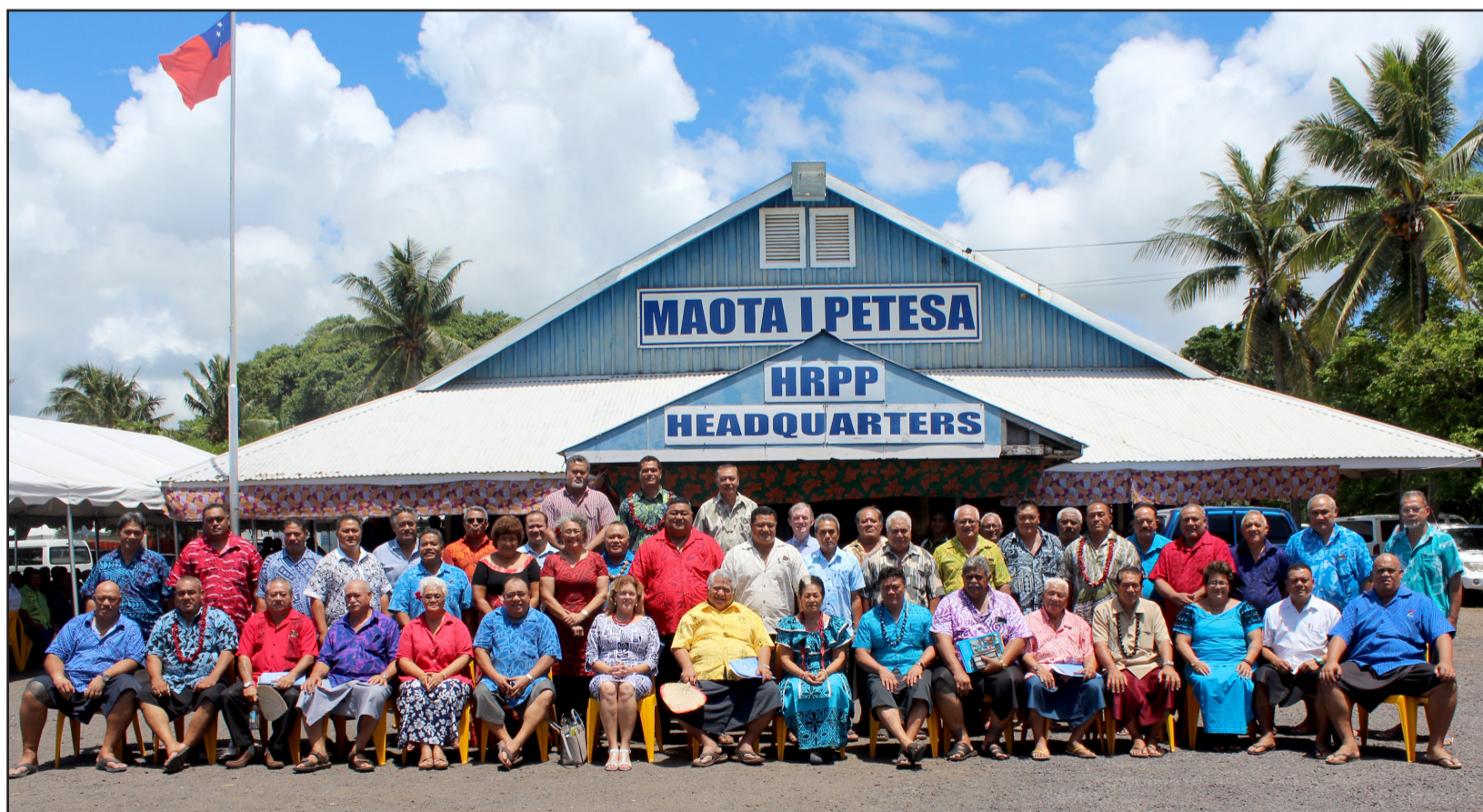
Human Rights Protection Party (HRPP) 2016.