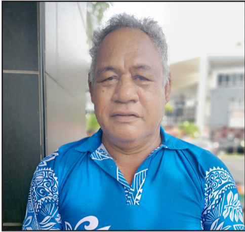
Ioapo Pisa 67 tausaga o Sa'anapu

Peita'i o le a fa'aāogaina fa'afiafiaga o Teuila o tausaga ua mavae, e tu'ufa'atasia ai polokalame mo le fa'amanatuina o le Teuila o lenei tausaga ma fa'asalalauina i luga o televise ma leitio e fa'aāogaina ai aua-la o feso'ota'iga fa'aneionapo (Digital).