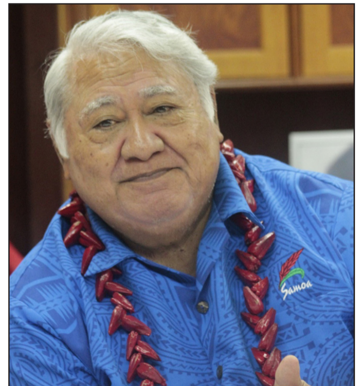
Prime Minister Tuilaepa Dr. Sailele Malielegaoi.

"However, our request to the Government of Japan for re-consideration due to the genuine need to improve transport shipping services was accepted," explained the Minister. And the end result, the Lady Naomi III which is fully funded by the Government of Japan will be delivered in two years' time.