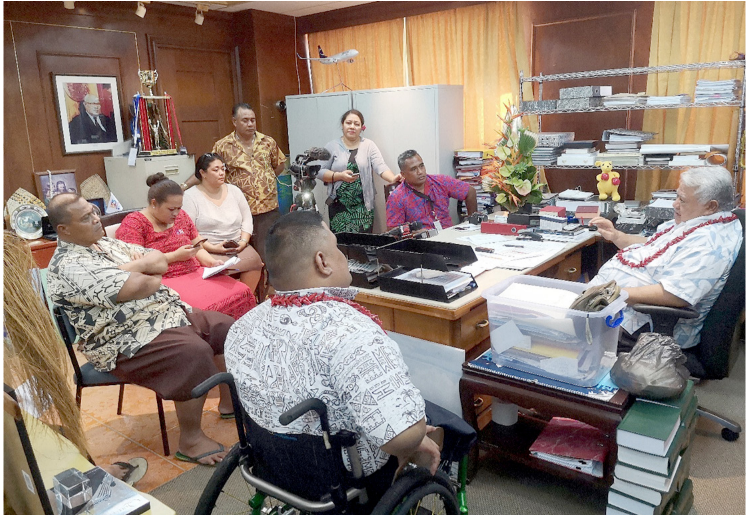
PM Tuilaepa hosting the local media yesterday afternoon.

“I had no knowledge of such a thing and at no time did the PM and I communicated on such mat-