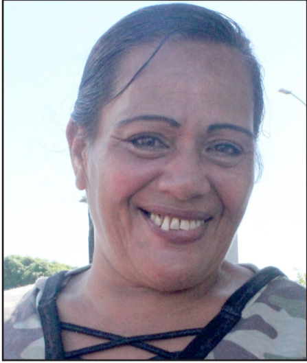
Meipo Tu 50 tausaga o Saleimoa

O le fa'amoemoe o le Malo ina ia tu'u'iti'itia i lalo ifo o le 50% le manaoga e fa'alagolago ai Samoa i mea'ai moa o lo'o auina mai atunu'u