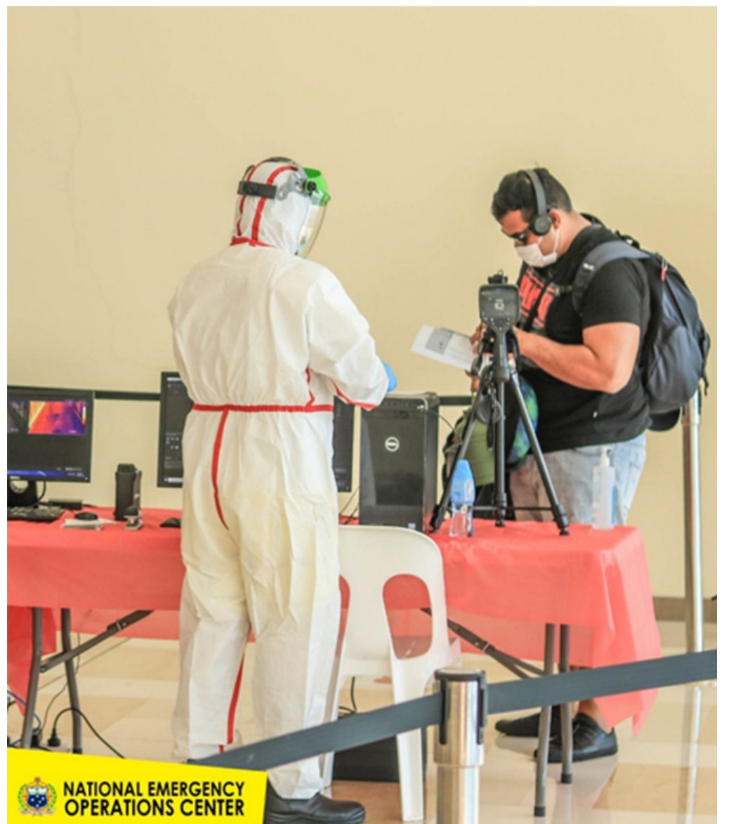
NATIONAL EMERGENCY OPERATIONS CENTER

"I want to give employers in the horticulture and viticulture industries as much certainty as possible in uncertain times, so I have taken the decision now even though next seasons workers will only be able to enter New Zealand when it is safe to relax border restriction."