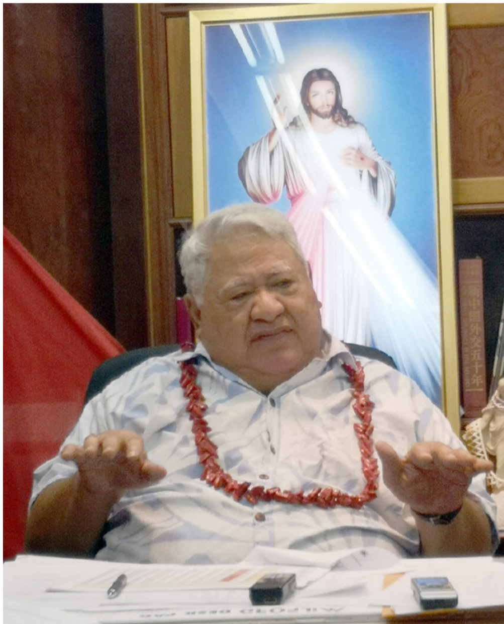
PM Tuilaepa to lead HRPP's 2021 General Elections Campaign.

Published by the Ministry of the Prime Minister & Cabinet (MPMC)