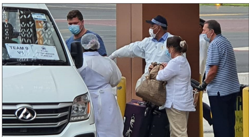
Samoans arriving on repatriation flight from New Zealand.