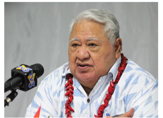
Palemia o Samoa, Tuilaepa Sailele Malielegaoi

Na fa'ailoa e le Palemia, na ia nofo sauni lava po'o le a le i'uga o le faiga filifiliga ma le tofā sasa'a a le latou Fa'afaletui, pe tumau pe suia fo'i se tasi, e fa'alogo lava ma usita'i i le finagalo autasi a Ta'ita'i o le HRPP, peita'i na autasi lava le tofā i le Fa'afaletui atoa, ma