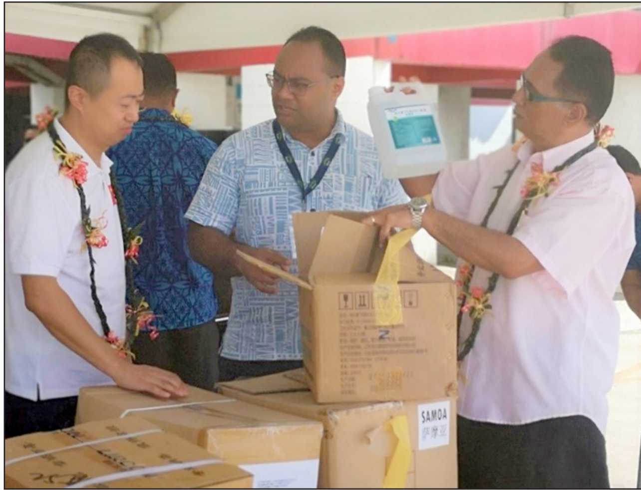
Pusa o vailā'au o lo'o silasila i ai sui o le Matagaluega ma le Sui o le Malo Saina na foaiina lenei meaalofa.

"Ua talafeuga lava ma lenei vaitau o le utiuti ma le maua gatā o vaega nei, ona e lē'o toe po malaē i