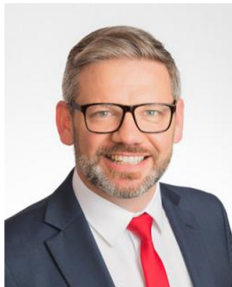
New Zealand's Immigration Minister Iain Lees-Galloway.

Iain Lees-Galloway said the RSE scheme is