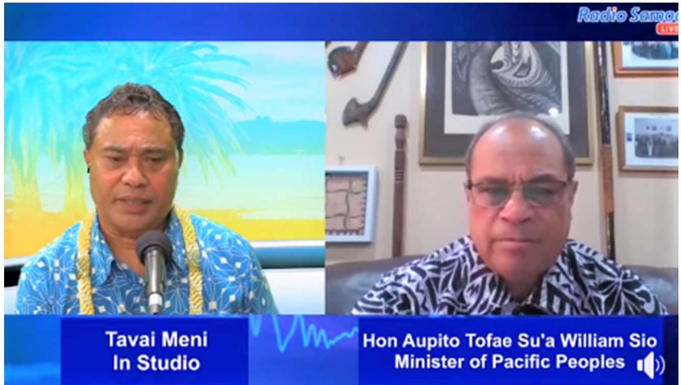
Fa'atalanoaga a le Radio Samoa ma le Minisita o Tagata Pasefika i Niu Sila ia Aupito Tofae Su'a William Sio.