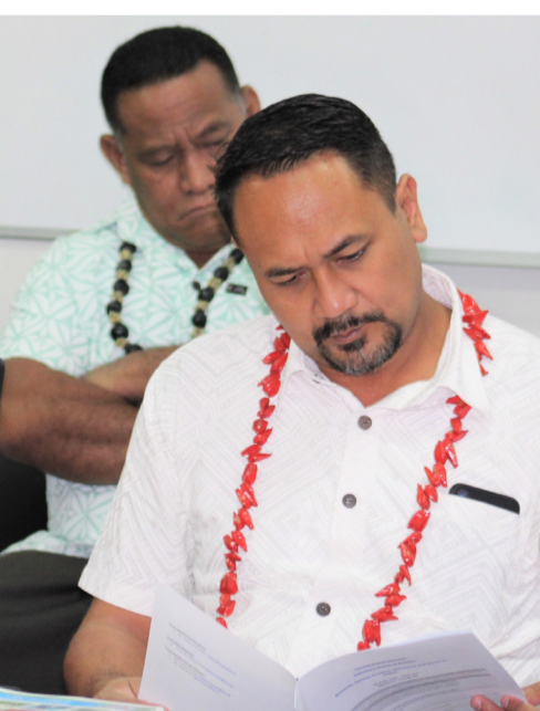
Officials at the presentation of Samoa's Second Voluntary National Review Report on the Implementation of the SDGs, at the UN Office, Tuanaimito.