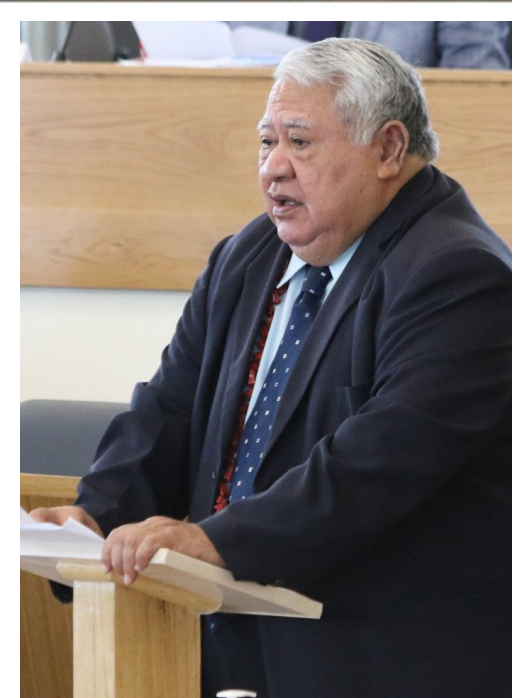
Tuilaepa Sailele Malielegaoi - Prime Minister