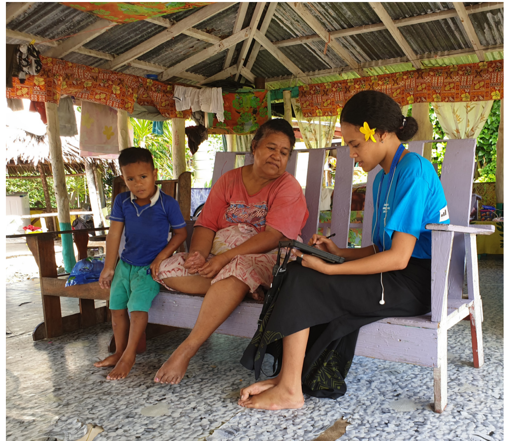
SBS workers in the community.