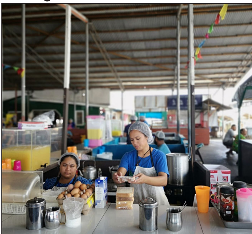
Falea'iga i le Maketi i Savalalo.