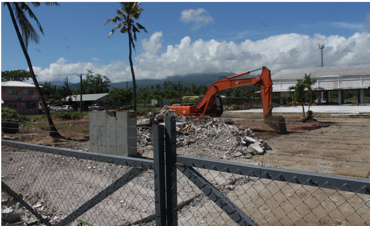
Landscaping work continues at Apia Park.

In the world of professional sports, the best teams and best players can only choose to play in professional fields with very good facilities. This will be a competitive edge for Samoa given the development of these new soccer fields. Tournament organisers will have a solid base for choosing Samoa as host country for soccer championships and international soccer fixtures for the Pacific in the