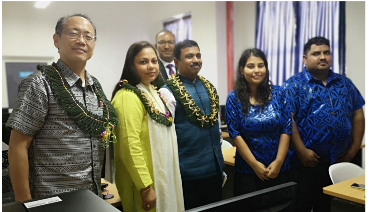
Hai Komesina o Initia i Samoa ma nisi o le auvalaaulia.

"E momoli fo'i le fa'amalo ma le fa'afetai i le Malo o Initia mo le fa'ama'ite ma le taulagalaga i mea lelei aemaise le fa'atupeina o masini, tasi a'oga fa'apea tomai ma agava'a ua fa'asoa mai, e poupu ai leni Laumua Fa'apitoa mo le lua (2) tausaga o le atina'e."