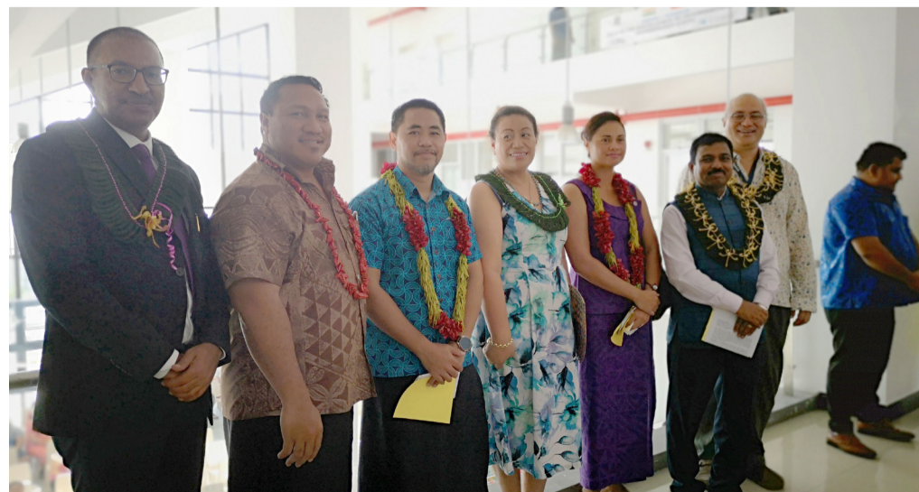
Ambassador of India and guests at the opening.

The centre also offers latest courseware and reference books for training of teachers, students, Government officials and working professionals; and aims to assist Samoa to leapfrog into IT and at the other hand will bridge the digital divide of urban and rural students.