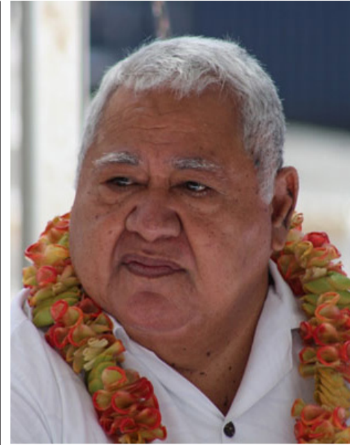
Afioga i le Palemia, Susuga Tuilaepa Lupe-soliai Dr Sailele Malielegaoi.

"Ae ui o lea e gafataulimaina i le taimi nei ae o loo tele lava le aafiaga (vulnerable) o Samoa i suiga o le tau ma aafiaga mai fafo atu o le atunuu e tatau ai ona faasoa lelei le faagaina o tatou tupe faaleoleo o iai nei."