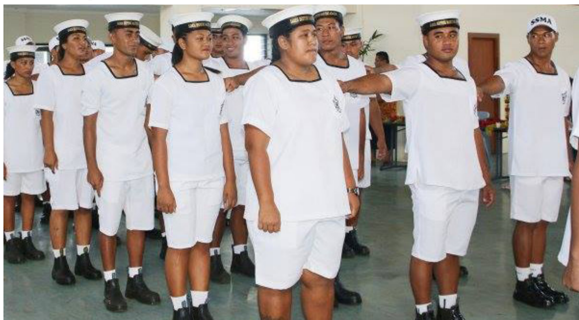
Sailors when graduating at Maritime school.