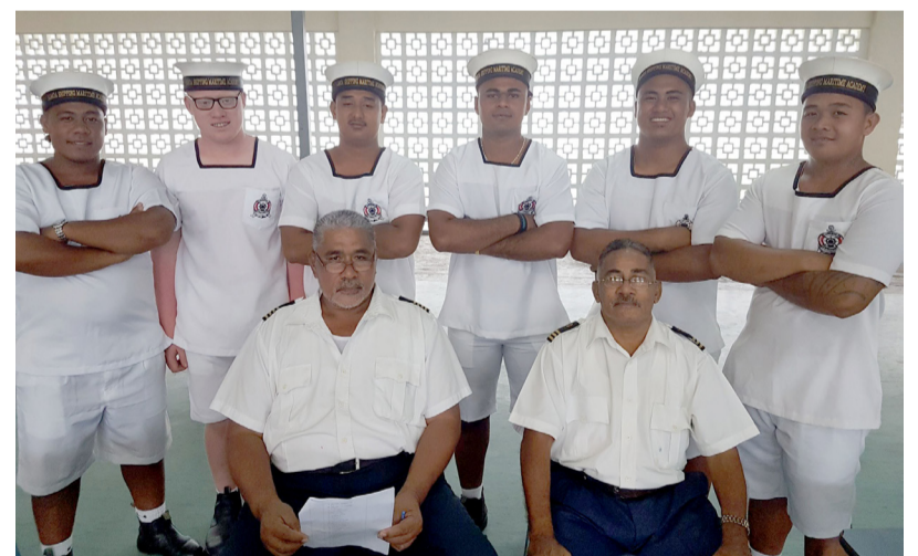
Nisi o alii seila a Samoa i le latou faauuga i tausaga ua mavae.

I le fa'a'opo'opo a le Pule Sili, na ia fa'amanino ai o lo o maua pea feso'ota'iga i aso ta'itasi a le Fa'alapotopotoga ma alo nei o le atunuu, e asia ai le tulaga o i ai lo latou saogalemu i nofoaga o lo o aumau ai.