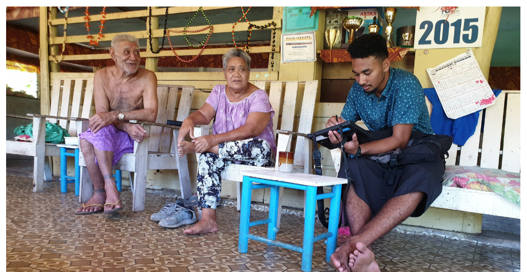
The use of tablet to record and store data by SBS staff.

• Internet connection problems especially in areas where the internet coverage is not as good as in Apia.