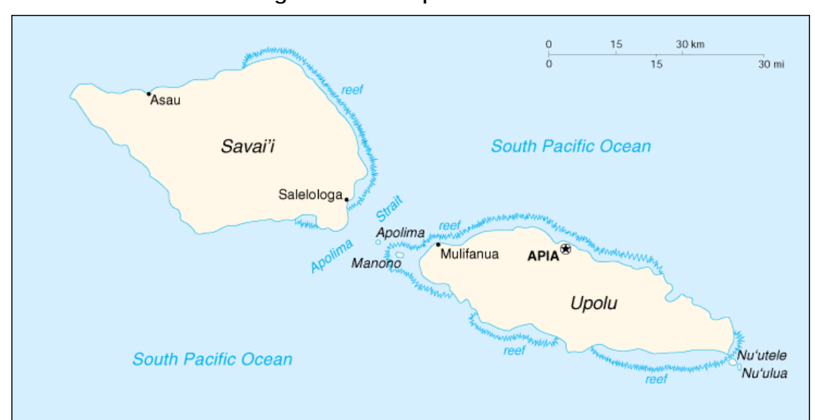
Figure 1 Map of Samoa<sup>1</sup>

Samoa comprises the two large islands of Savaii and Upolu (separated by a one-hour boat trip) and a group of smaller islands (see Figure 1). Over three-quarters of the population live on Upolu, the majority in Apia, which is the government, commercial and administrative centre. The main Police Station is located in Apia, but reports were that most families are within two hours of a Police sub-station.