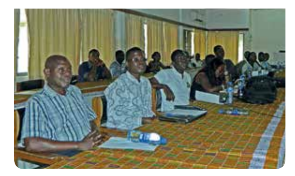
Academics in Ghana