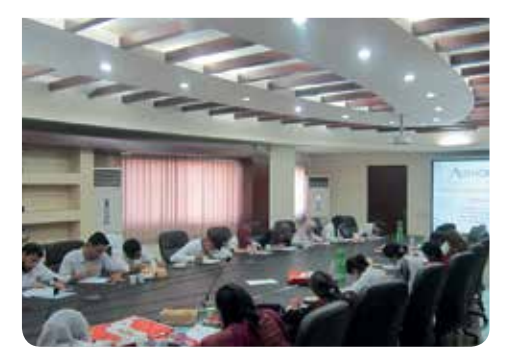
Hands on exercise at a Pakistan AuthorAID workshop