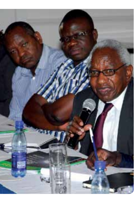
Climate change roundtable in Kenya

Tackling the world's great challenges and achieving inclusive social and economic development need, now more than ever, the fullest use of science, data and research.