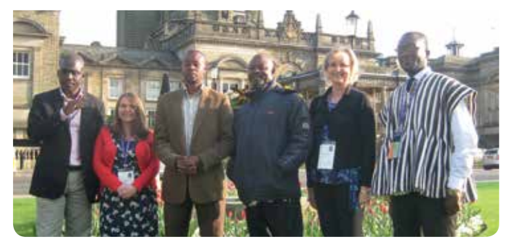
INASP staff and sponsored delegates at the 2014 UKSG conference