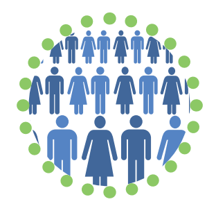
More than 10,000 researchers in AuthorAID community