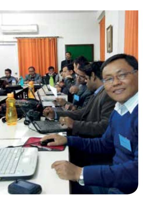
Participants at journal quality workshop, Nepal

INASP builds up the capacity of local publishing through the Journals Online platforms and through training of journal editors and publishers.