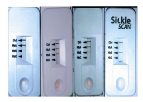
Figure 2. Monitoring of the test Hb results using Sickle SCAN*. Legend: Form left to right: Hb AA, Hb As, HbAS (with S pale), and Hb SS.

The results of the sickle SCAN* and LC-MS screening were compared by calculating the percent agreement (Cc) and the Kappa coefficient ( \kappa ). In medicine, a correct \kappa coefficient between two techniques must be greater than 0.8 [21].