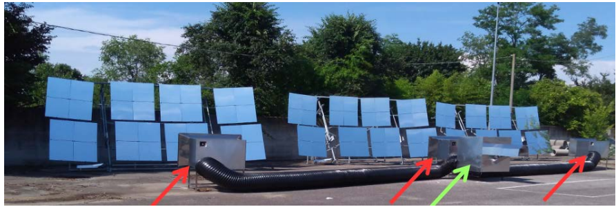
Figure 1. The installation at the A & T2000 site. The heat exchangers are indicated with red arrows, the toaster with a green arrow.

Each mirror is mounted on a rod normal to the mirror surface, this rod forms the diagonal of an Euclidean kite (sometimes also called deltoid). One side of the deltoid is always pointing to the solar absorber (which remains always in the same position), and one side is pointing towards the sun. This is described in more detail in [9]. The eight deltoids are mechanically connected to each other, so that three small electrical motors can move all mirrors concurrently, reflecting the sun light onto the common heat exchanger. In comparison, a conventional system of eight heliostats would need 16 motors to achieve the same effect. Each of the eight mirrors is composed of four sections, which are slightly inclined with respect to each other, in order to further increase the light concentration of the system.