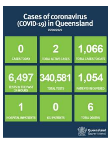
FIGURE 2: DAILY FACEBOOK POST SOURCE QUEENSLAND HEALTH [20]

Platforms such as Twitter have been active sharers of information and COVID related research. [22] Controversy and debate have emerged over mask wearing and new evidence reviews have been promoted on Twitter. [23] #Masks4all.org.uk was established by more than one hundred doctors to promote the wearing of home-made masks to reduce direct transmission and environmental contamination. This group is active on Twitter, Instagram and Facebook and share the emerging evidence on masks.[24]