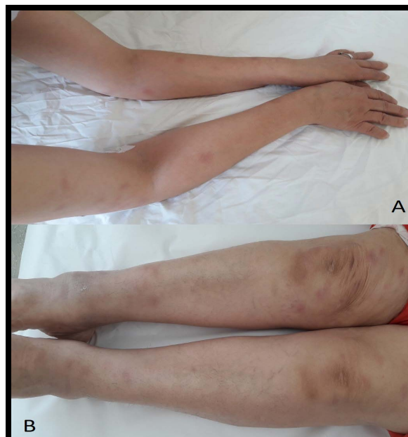
Figure 1. Aspect of EN at admission (A: upper limbs/B: lower limbs).

The patient received a symptomatic treatment consisting of Vitamin C, antihistaminic, emollient and dermocorticoids. 10 days after initial diagnosis, the patient had a slight improvement of the lesions ( Figure 3 ).