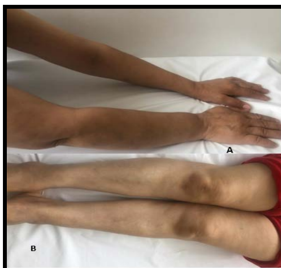
Figure 3. Aspect of EN 10 days after treatment.