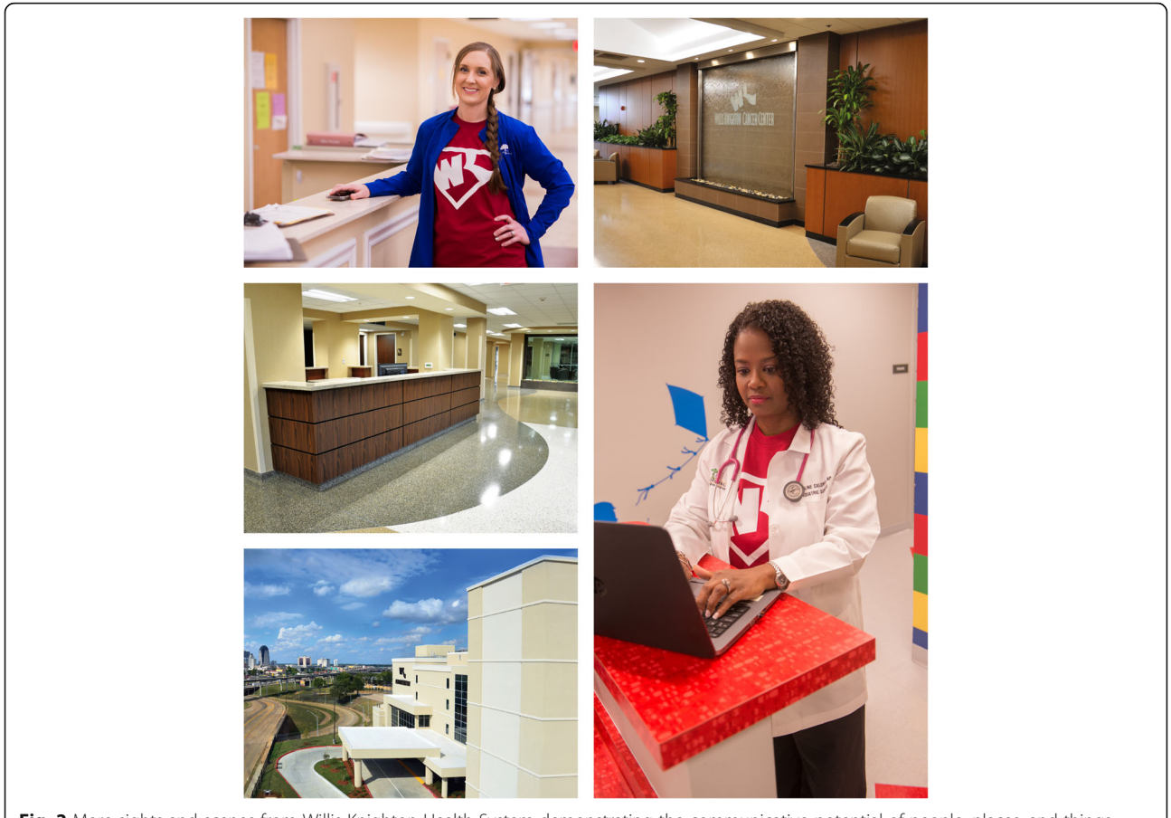
Fig. 2 More sights and scenes from Willis-Knighton Health System demonstrating the communicative potential of people, places, and things

healthcare providers do not lose focus in their quests to proficiently engage patients, this article profiles foundational elements of communication and discusses their importance in healthcare marketing, generally, and marketing communications, specifically, providing useful insights for maximizing communicative synergies.