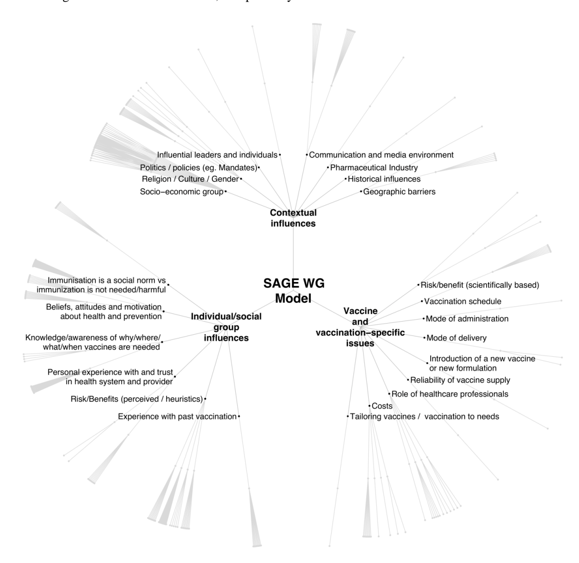
Figure 1. Overview of SAGE Working Group (WG) "Model of determinants of Vaccine Hesitancy" (source: Larson et al. Vaccine 2014; 32, 2150-9).

The instrument used for data collection was adapted from the model developed by the Strategic Advisory Group of Experts Working Group (SAGE WG) for the assessment of the determinants of vaccine hesitancy. This framework is effective and reliable and is commonly used to identify the main determinants of vaccine hesitancy. The SAGE WG framework serves as a standard because it considers the common psychosocial factors that are related to vaccine hesitancy. According to SAGE WG framework, vaccine hesitancy can be assessed under three main arms: a) contextual influences; b) individual/social group influences and c) vaccine and vaccination-specific issues (Figure 1). Some aspect of these arms especially the vaccine and vaccination-specific arm can be evaluated using three domains: confidence, complacency and convenience.