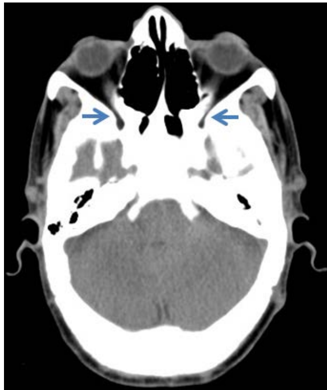
Figure 1. Cerebral orbital CT scan in axial section showing a narrowing of the caliber of the optical channels (blue arrows).

Retinal angiography revealed lesions suggestive of compressive ischemic optic neuropathy ( Figure 3 ). From those findings we retained the diagnosis of blindness due to ischemic optic neuropathy, secondary to CKD-MBD, compressive of the optical channels.