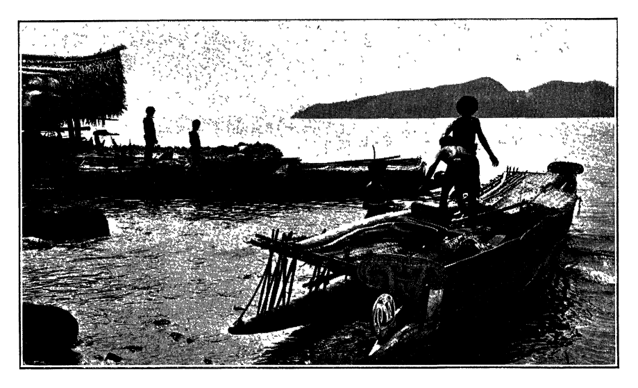
LOADING LARGE CLAYPOTS IN THE AMPHLETT ISLANDS, IN CONNECTION WITH THE KULA.

This does not exhaust the subtleties and distinctions of Kula gifts. If I, an inhabitant of Sinaketa, happen to be in possession of a pair of armshells more than usually good, the fame of it spreads. It must be noted that each one of the first-class armshells and necklaces has a personal name and a history of its own, and as they all circulate around the big ring of the Kula, they are all well known, and their appearance in a given district always creates a sensation. Now all my partners—whether from overseas or from within the district—compete for the favour of receiving this particular article of mine, and those who are specially keen try to obtain it by giving me pokala (offerings) and kaributu (solicitory gifts). The former ( pokala ) consists, as a rule, of pigs—especially fine bananas and yams or taro; the latter ( kaributu ) are of greater value: the valuable "ceremonial" axe blades (called beku ) or lime-spoons of whale's bone are given. There are further