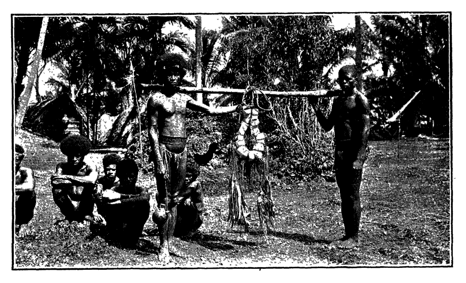
ARMSHELLS CEREMONIALLY BROUGHT INTO OMARAKANA VILLAGE FROM A SMALL EXPEDITION TO KITAVA.

The Kula has been called above "a form of trade." The usual a priori notion of savage trade would be that of an exchange of indispensable, or, at least, useful