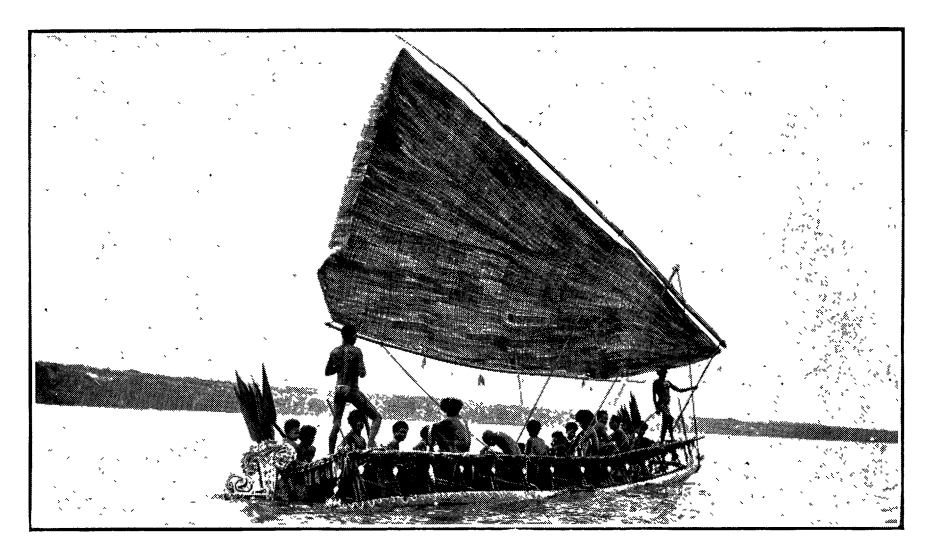
A SEA-GOING KULA CANOE UNDER SAIL.