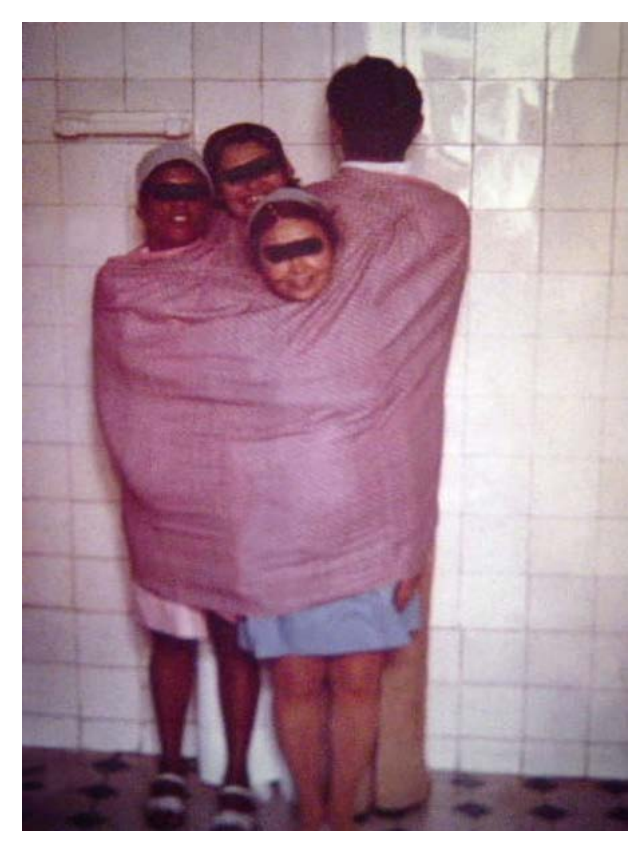
Figure 14. Dress worn on the 1st admission (4 people inside).