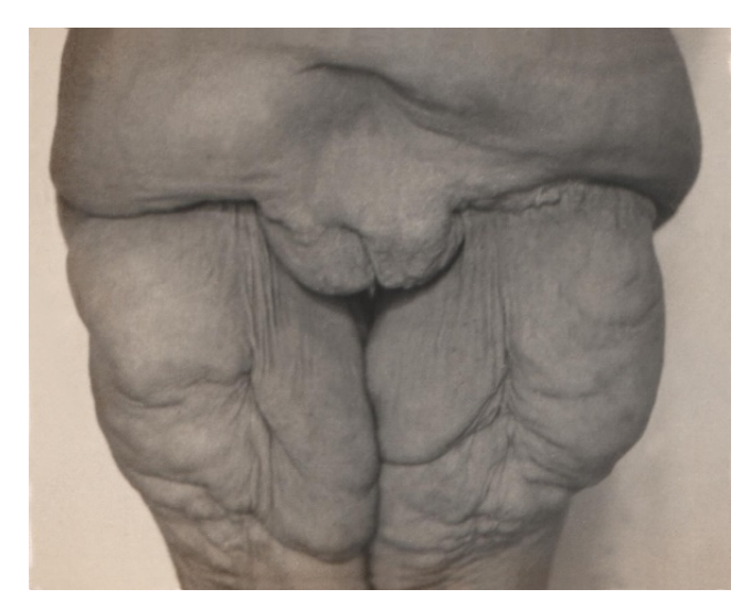
Figure 6. Preoperative of thighs and pubic mount.