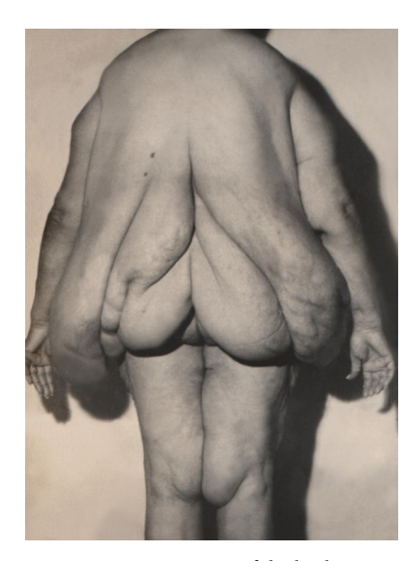
Figure 10. Preoperative of the back.