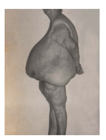
Figure 3. Preoperative profile after 1st weight loss.