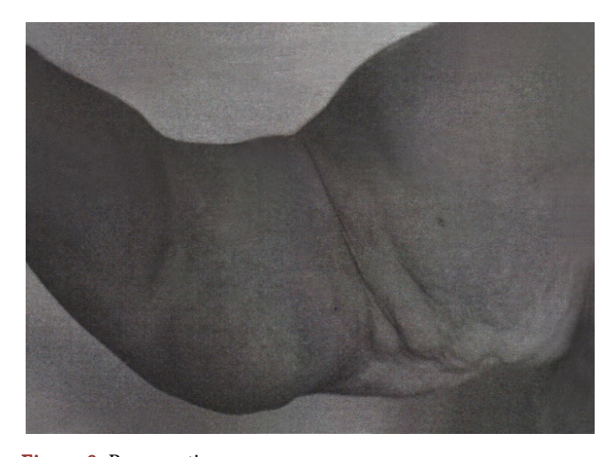
Figure 8. Preoperative arm.