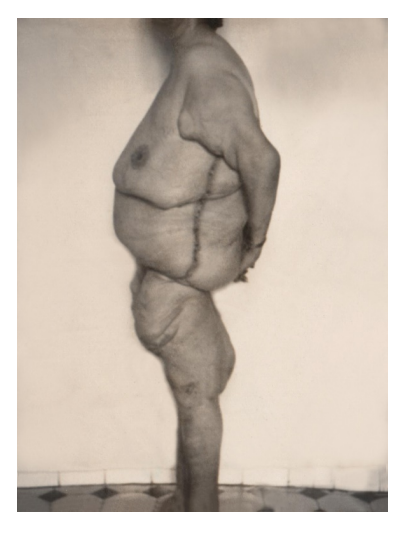
Figure 4. Postoperative of the 1st breast surgery and postoperative with 4 days of longitudinal abdominal surgery.