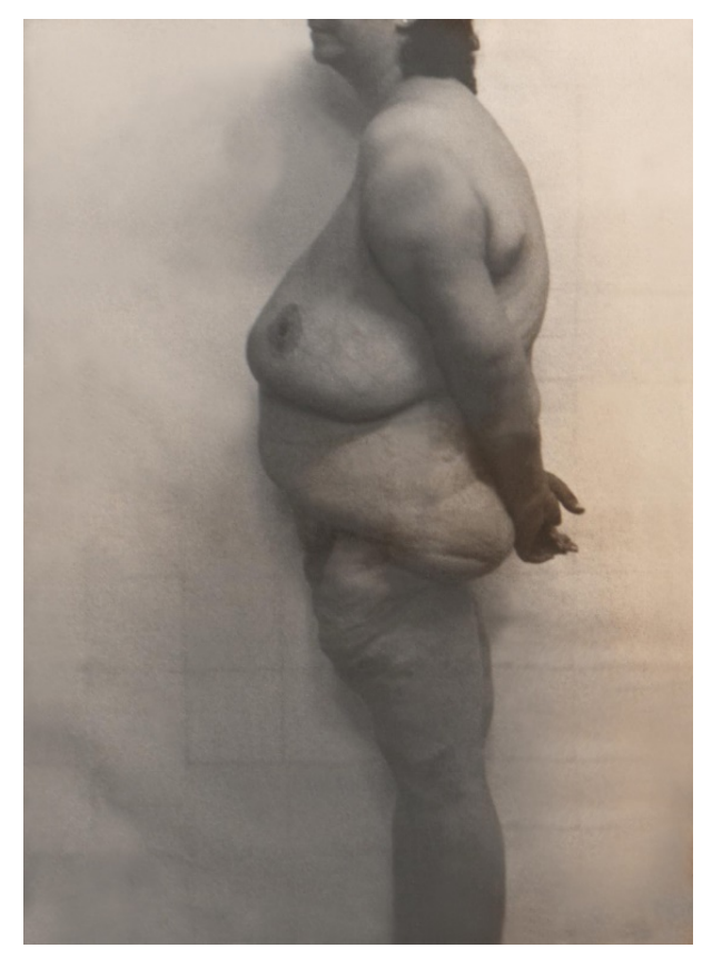
Figure 5. Postoperative profile at 6 months.