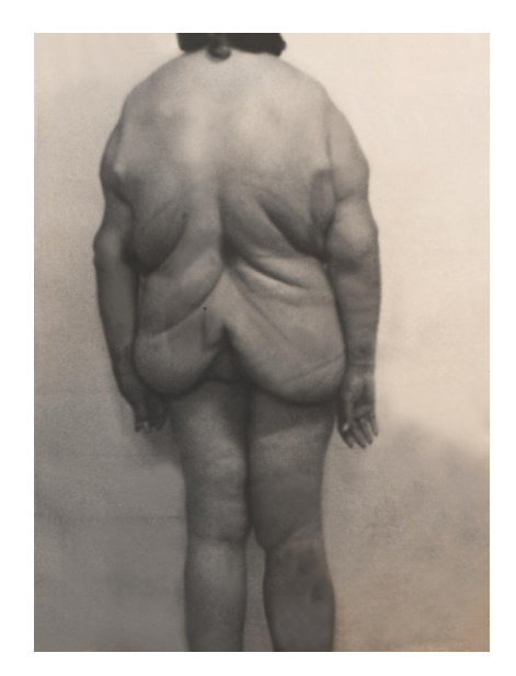
Figure 11. Post-operative of the back after the 1st surgery of the breasts and abdomen.