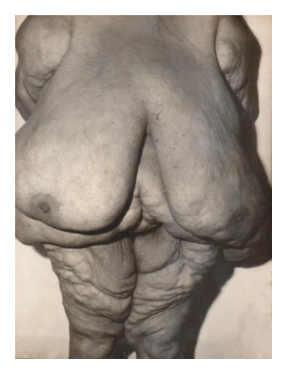
Figure 2. Preoperative of the breasts (2 layers).