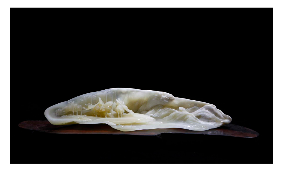
Figure 3. The High Aspiration (author: Chenglin Ming).