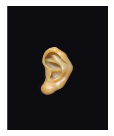
Figure 2. The Ear (student: Bitong Luan).