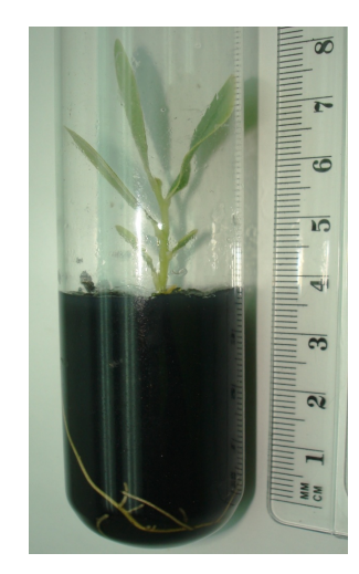
Figure 3. Vitroplant of Annona senegalensis in vitro rooted.

In the same column, the values followed by the same letter are not significantly different at the 5% threshold of the Newman-Keuls's test. IAA: Indole-3-acetic acid; IBA: Indole-3-butyric acid.