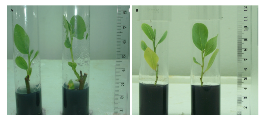
Figure 2. Newly formed shoots (A, B) from adult material of Annona senegalensis.

In the same column, the values followed by the same letter are not significantly different at the 5% threshold of the Newman-Keuls's test. MS: Murashige & Skoog medium; BAP: 6-Benzylaminopurine; KIN: Kinetin (6-furfuryl aminopurine); NAA: 1-Naphthaleneacetic acid.