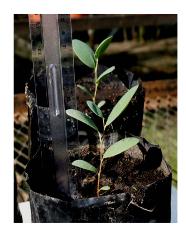
Figure 4. Young acclimatized plants of Annona senegalensis Pers., after 3 months under shade.

Lot 1: young plants kept directly in the shade in the greenhouse, and then on the bench. Lot 2: young plants kept in a mini-greenhouse, then under natural conditions.