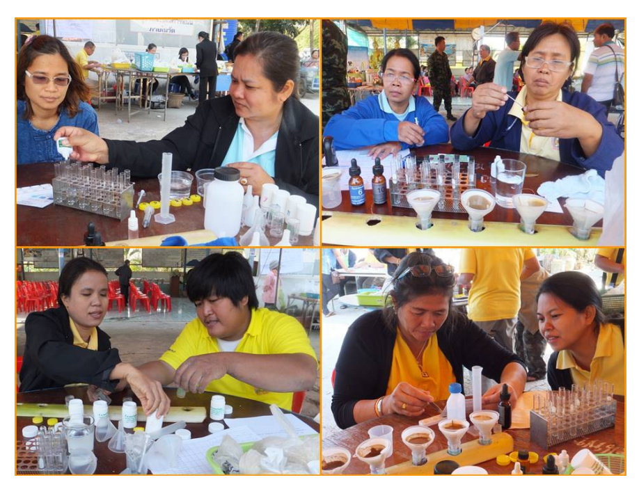
Figure 6. Soil analysis is provided to farmers by farmer leaders on January 18, 2015.