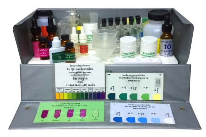
Figure 1. KU soil test kit.

farmland. In 2002 a practical handbook was developed for identifying soil series that enabled extension officers and farmer leaders to identify the soil series by themselves. Subsequently, the developed procedure was published [4]. It is sometimes more convenient to use existing soil series maps at sub-district level as a simple visual tool ( Figure 2 ).