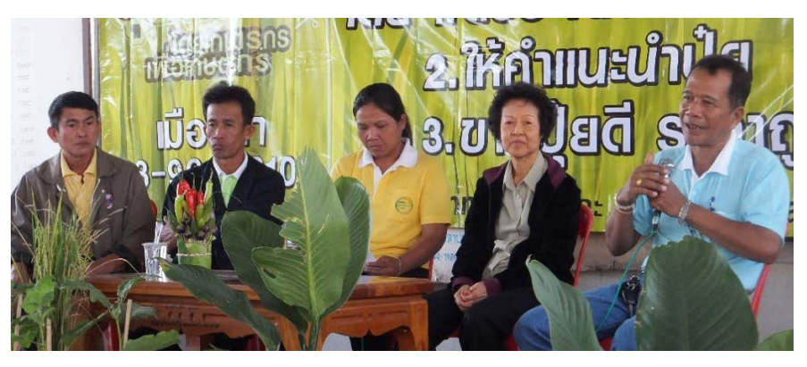
Figure 5. Farmer leaders sharing experiences from using TFT in rice production on January 18, 2015.

waiting for the results of soil analysis, they can attend a learning forum described above. Then, after lunch, the results of soil analysis with the fertilizer recommendation are presented and discussed with the farmers ( Figure 6 ).