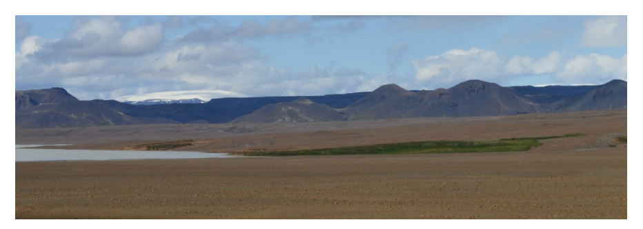
Figure 1. Example of degraded communal areas in Iceland. Vegetation remnants in a barren "desert" area at 2 - 300 m elevation. A 1 - 2 m thick fertile Andosol has been fully removed by erosion by wind and water, leaving the barren gravelly surface behind. The lower elevations of this area were fully covered with birch woodlands and harvested for fuel-wood into the 1600's. The degradation was land-use driven. The area is a common and continues to be grazed by sheep. Birch woodlands can be returned to areas like these by strategic restoration efforts [9] Photo: O. Arnalds 2018.

A large proportion of the highland communal areas used for grazing have limited vegetation cover and have been subjected to severe ecosystem collapse since the arrival of man to Iceland around 870 [3]. The remaining vegetation is often in poor condition (Figure 1). The commons with the least vegetation cover