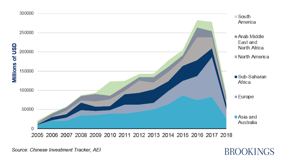
Figure 2. The Chinese investment tracker.

of Technology is the highest influential factor for any technology transfer within the area of the study. The concreteness of technology in the study is defined as the specificity and definiteness of the technology being transferred. And it is the degree of knowledge that comes with it.