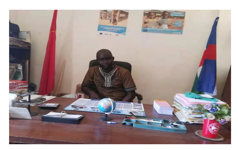
Photo 4. Friendship primary school acting principal.