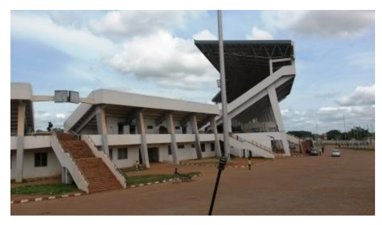
Photo 6. Stadium.