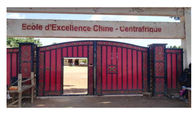
Photo 3. Friendship primary school.

ment. It helps the population feel convenient about the sport and when they want to move around the city.