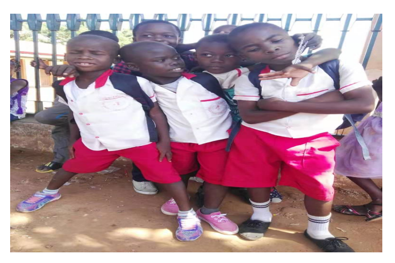
Photo 5. Friendship primary school students.