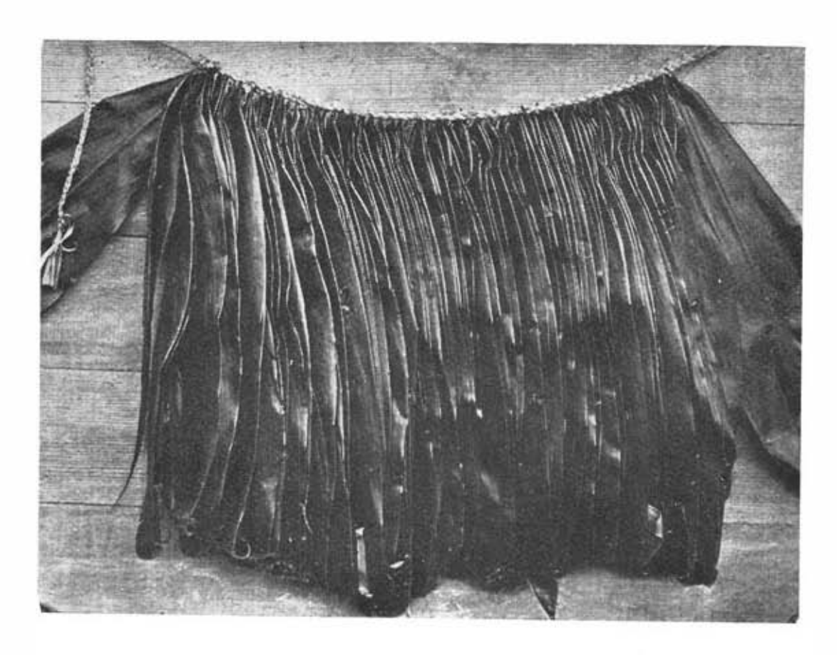
PLATE 7. Kilt of unsplit 16 leaves from Rapa Island. PLATE 7.