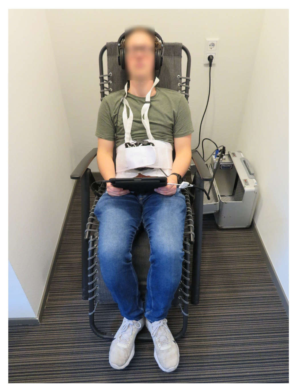
Fig 2. The equipment used for both the HALF-MIS treatment and the higher frequency variant in a clinical setting. Reprinted from T.A.H. Eshuis et al. under a CC BY license, with permission from T.A.H. Eshuis et al., original copyright [2021].

https://doi.org/10.1371/journal.pone.0259394.g002