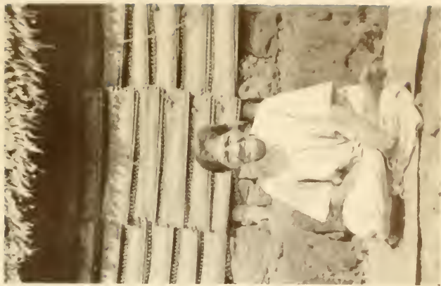
A famous maker of bark cloth