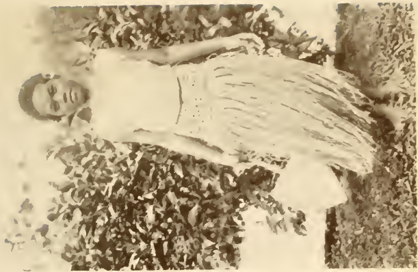
Dressed up in her big sister's dancing skirt