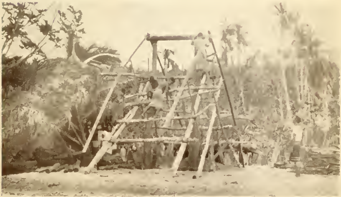
Rebuilding the village after a hurricane