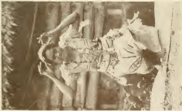
A dancing costume for European tastes