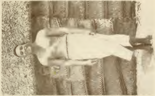
By name, "House of Midnight Darkness"