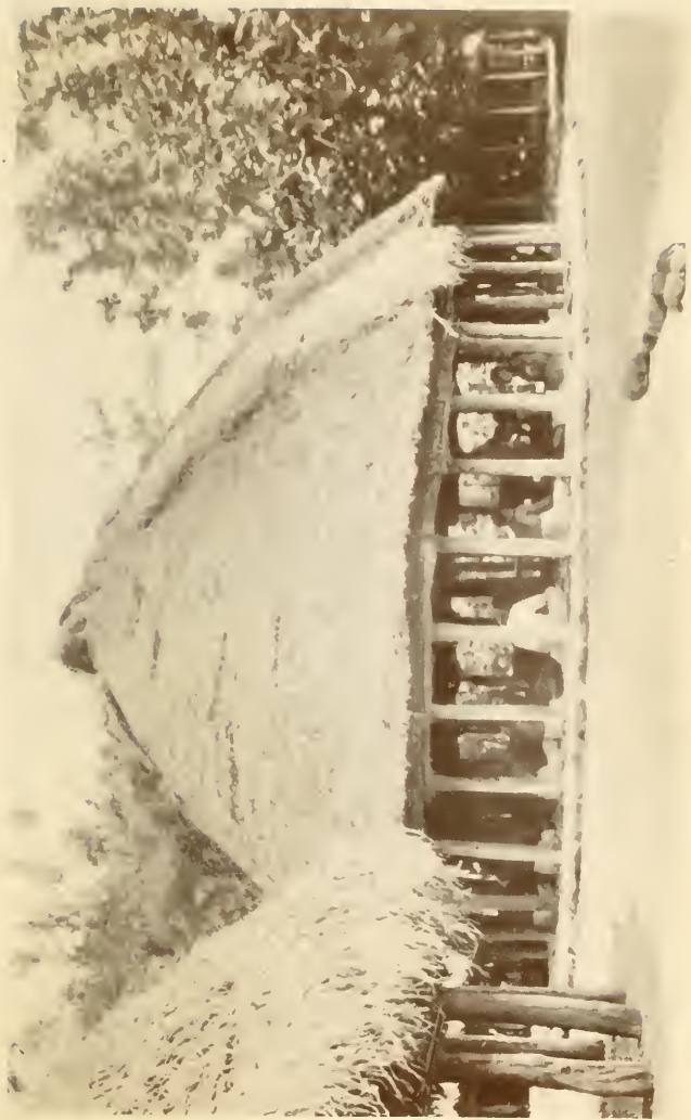
The local parliament is covered