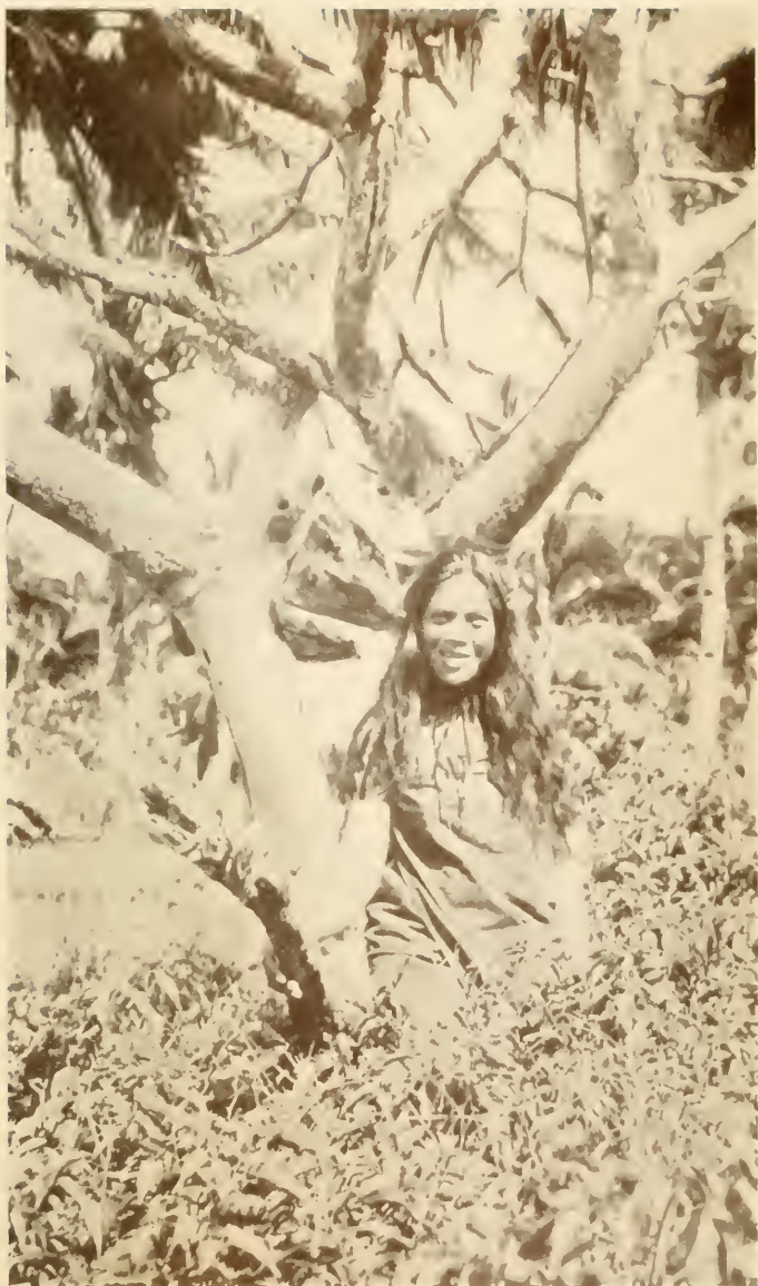
A spirit of the wood