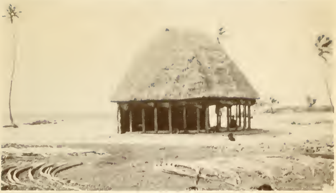
The "House to meet the Stranger"