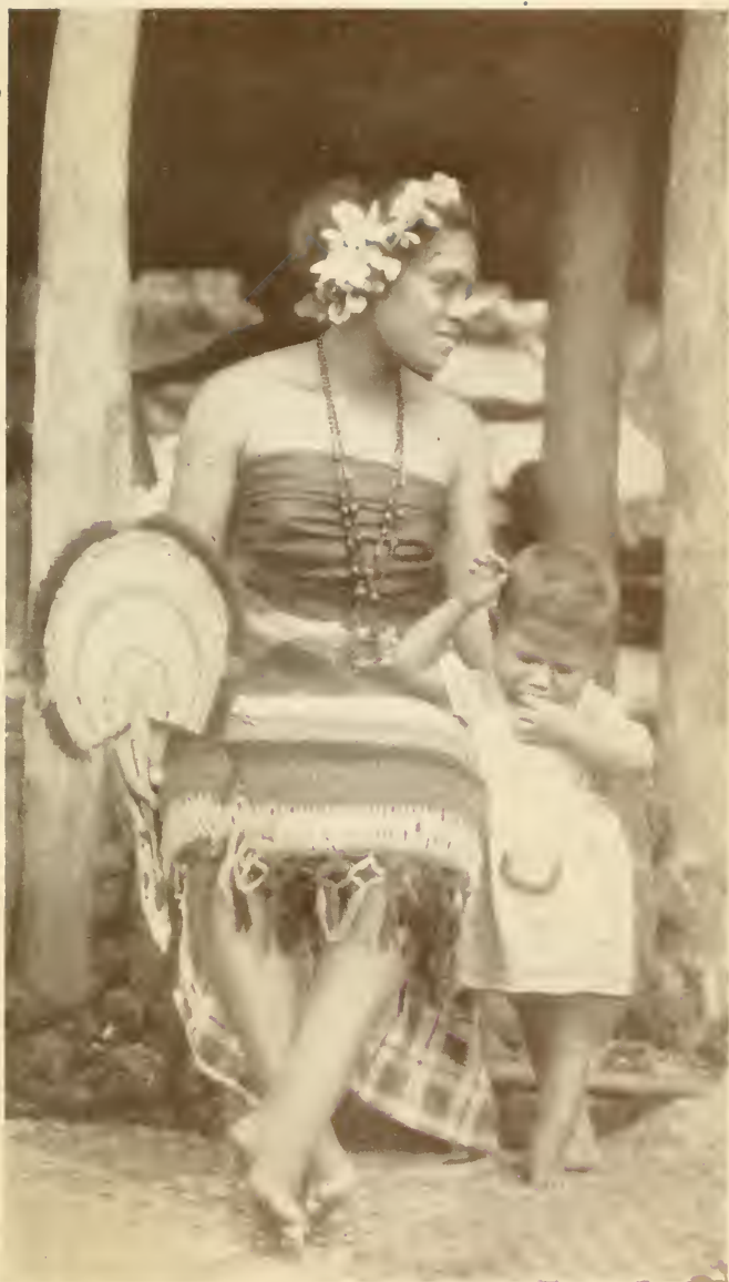
A chief's daughter and the baby of the household whose yellow hair will some day make a chief's headdress