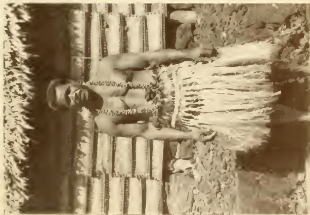
A Talking Chief—the native Master of Ceremonies