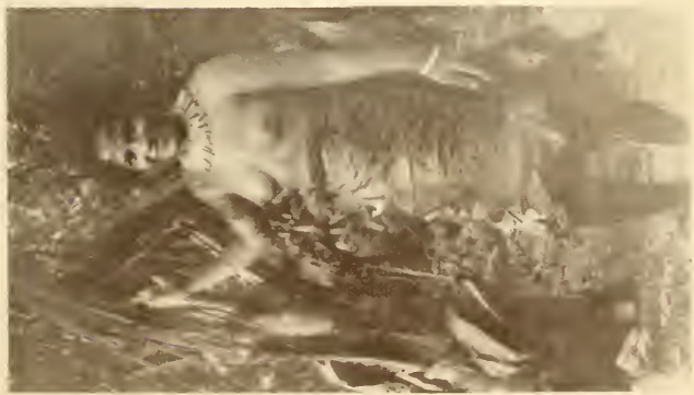
In the bark cloth costume of long ago