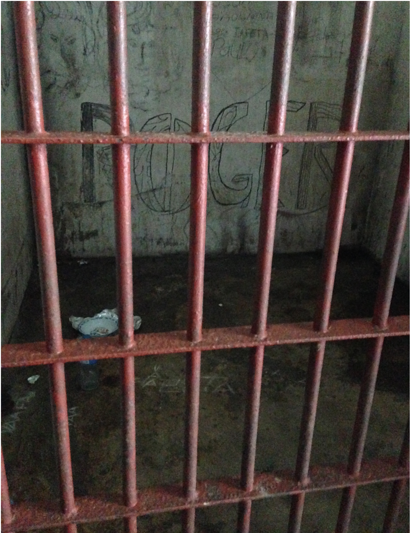
CUSTODY CELLS AT TUASIVI CUSTODY CELLS, SAVAII, JANUARY 2015