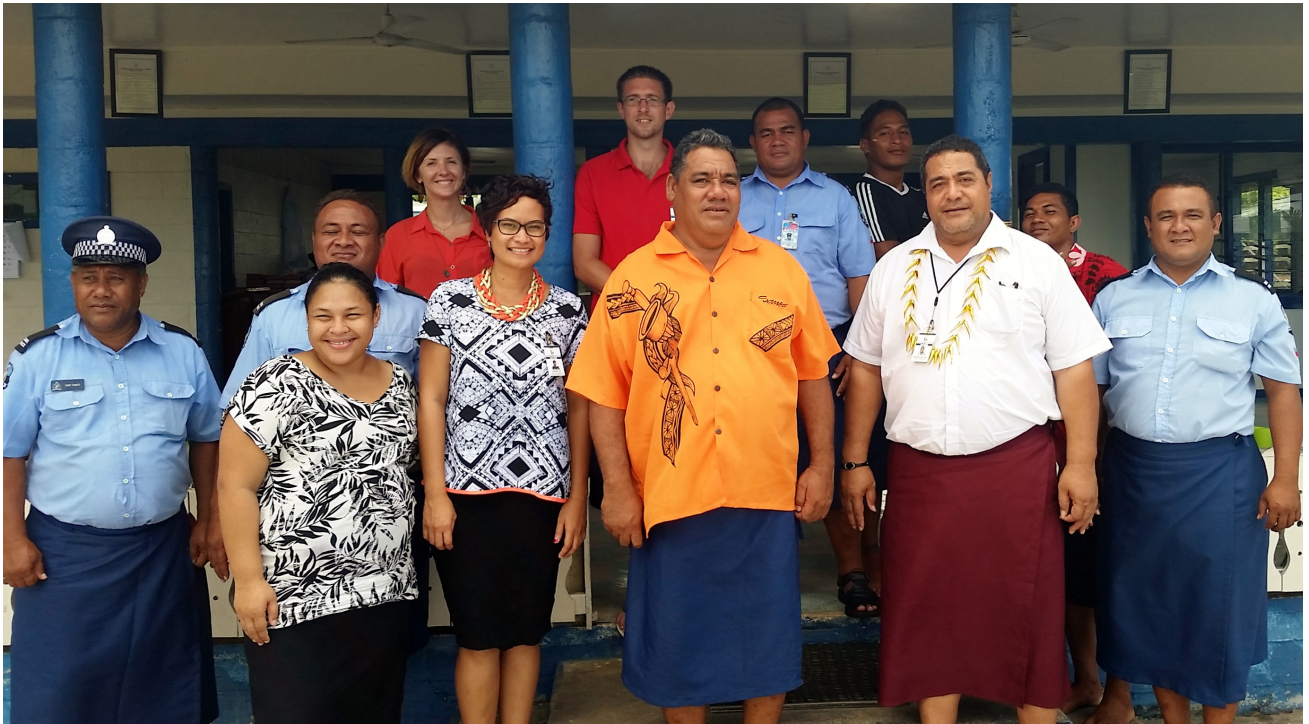
NHRI INSPECTION TEAM WITH PRISONS AND CORRECTIONS OFFICERS AT OLOMANU JUVENILE CENTRE, JANUARY 2015