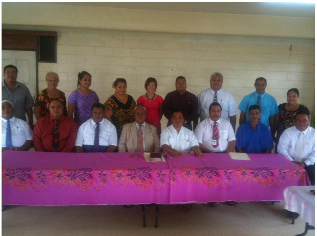
NHRI IN CONSULTATION WITH THE NATIONAL COUNCIL OF CHURCHES 12 MARCH 2015