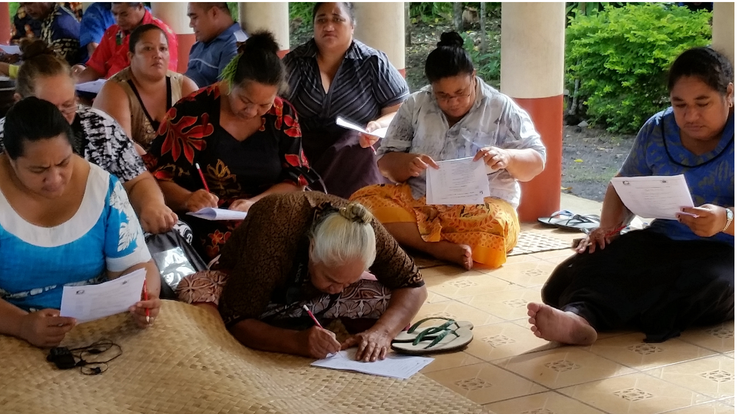
WOMEN FOCUS GROUP DISCUSSIONS IN THE VILLAGE OF IVA, SAVAII, 11 MARCH 2015