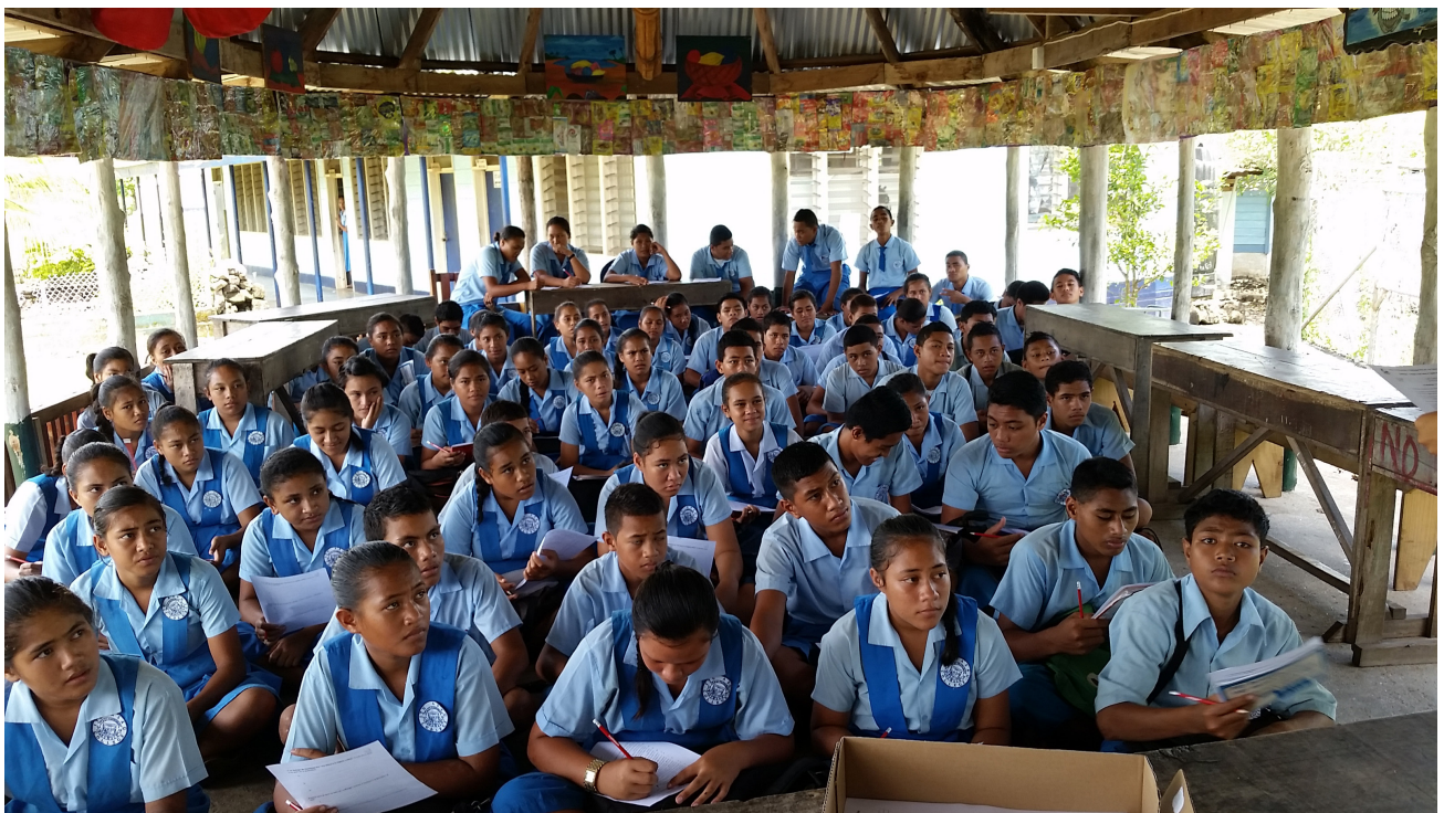
SCHOOL SURVEY AT ITU O ASAU COLLEGE, 12 MARCH 2015