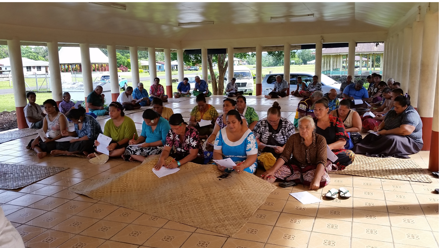
IVA VILLAGE CONSULTATIONS, 11 MARCH 2015