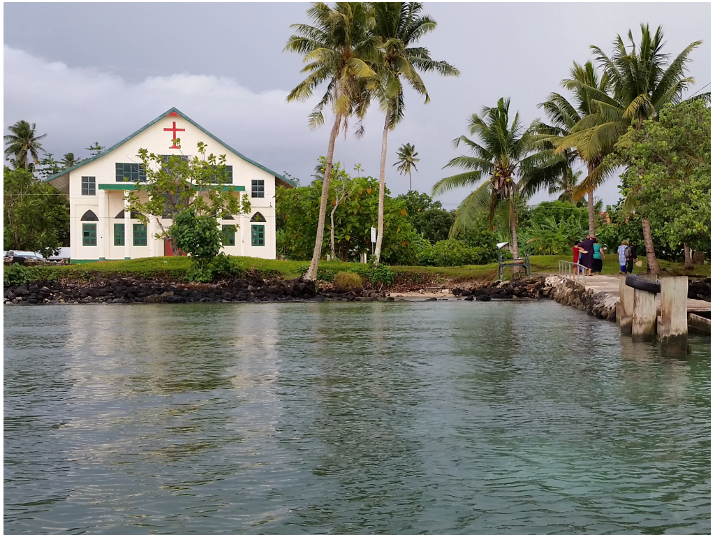
METHODIST CHURCH ON MANONO ISLAND