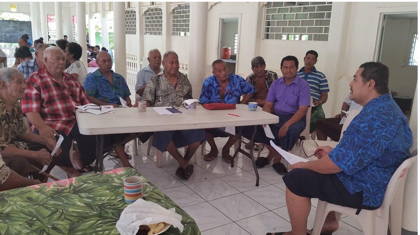
TITLED AND UNTITLED MEN FOCUS GROUP DISCUSSIONS IN THE VILLAGE OF MOATA'A, 14 MARCH 2015.