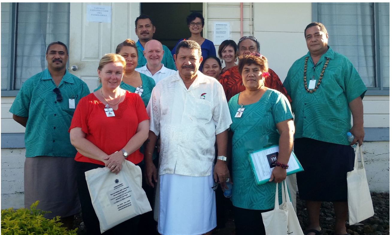
NHRI INSPECTIONS TEAM WITH PRISONS AND CORRECTIONS COMMISSIONER, TAITOSUA F E WINTERSTEIN, JANUARY 2015