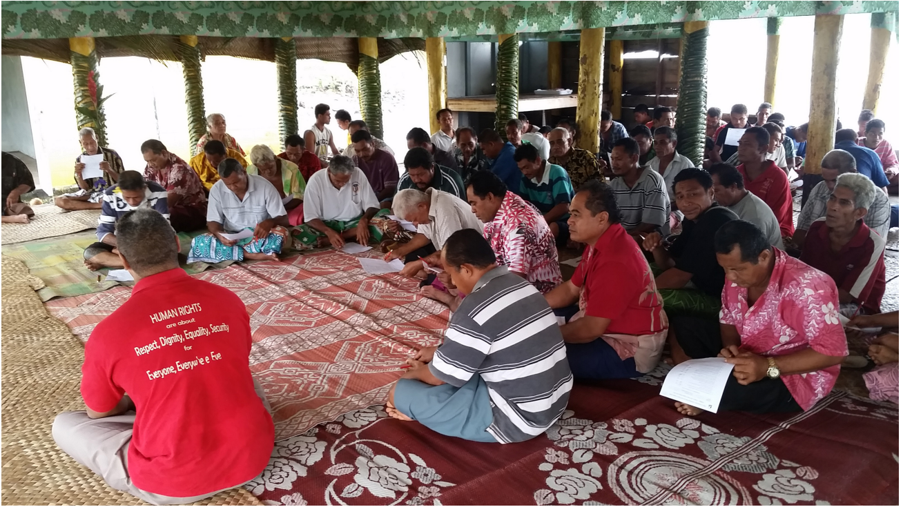
TITLED AND UNTITLED MEN FOCUS GROUP DISCUSSIONS IN THE VILLAGE OF SASINA, SAVAII, 12 MARCH 2014