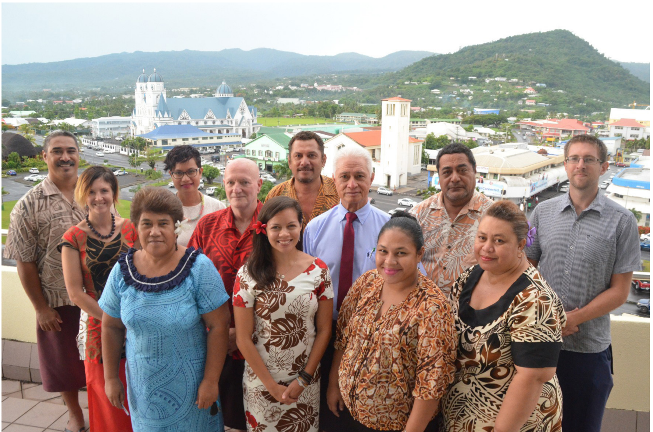
STAFF OF THE OFFICE OF THE OMBUDSMAN AND NHRI 2015