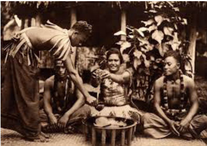
SAMOAN CULTURE AND TRADITIONS: 'THE AVA CEREMONY'