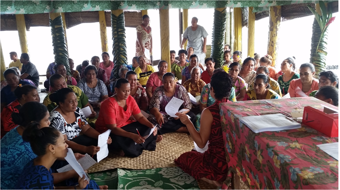
WOMEN FOCUS GROUP DISCUSSIONS IN THE VILLAGE OF SASINA, SAVAII, 12 MARCH 2015.