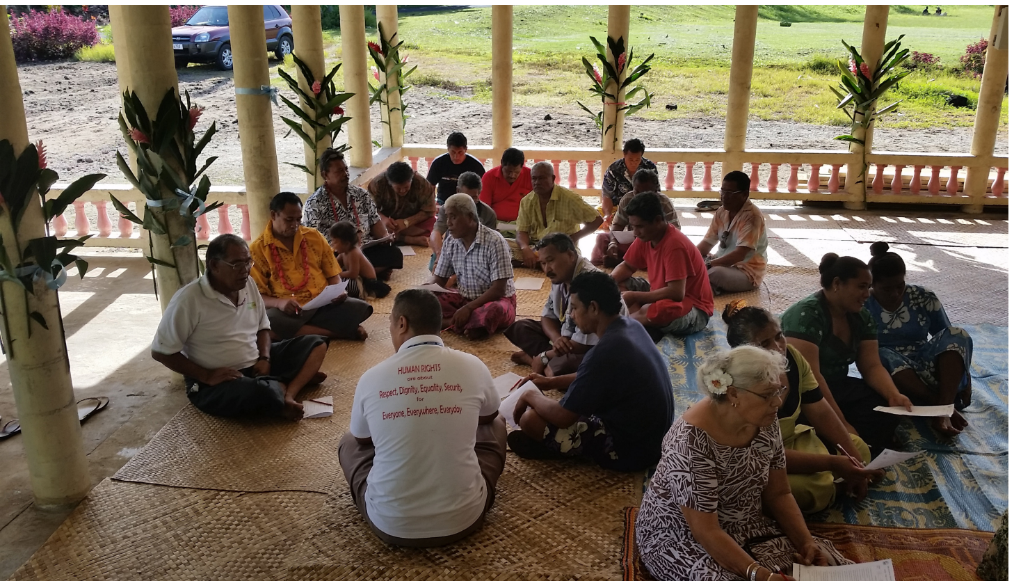
MEN FOCUS GROUP DISCUSSIONS AT THE VILLAGE OF FALEALUPO, SAVAIL, 13 MARCH 2015