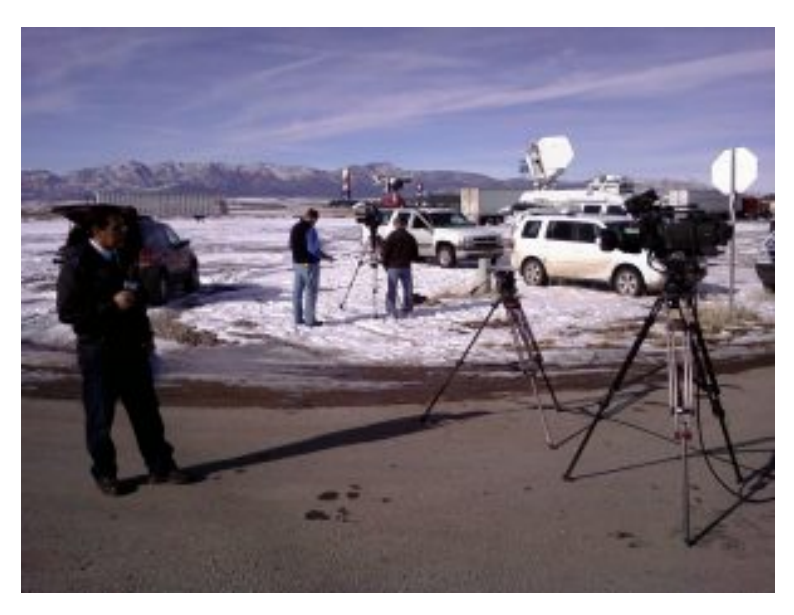
Multiple competing live shots set up in Delta, Utah.

Live shots are an integral part of most television newscasts; they used to be what set us apart from other media. The live capability of social media is changing the game, but for the