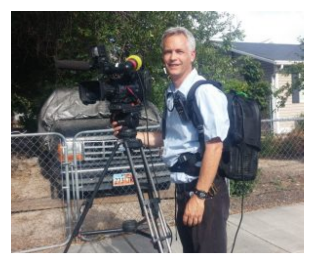
Self-contained backpack cellphone system going live in Ogden, Utah.

COFDM stands for Coded Orthogonal Frequency Domain Multiplex, and don't worry, you don't need to know that. You should know it is a compact transmitter, small enough to attach to the back of the camera, and with a shorter range.