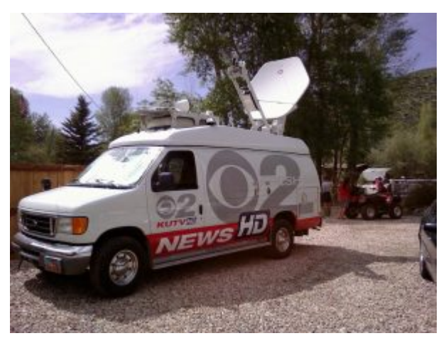
KUTV satellite truck going live in rural Utah.

Technology is changing the way live shots are done. In the old days (up until 2010-ish) there were two options: satellite truck or microwave truck. There are more paths to get video back to the station now.