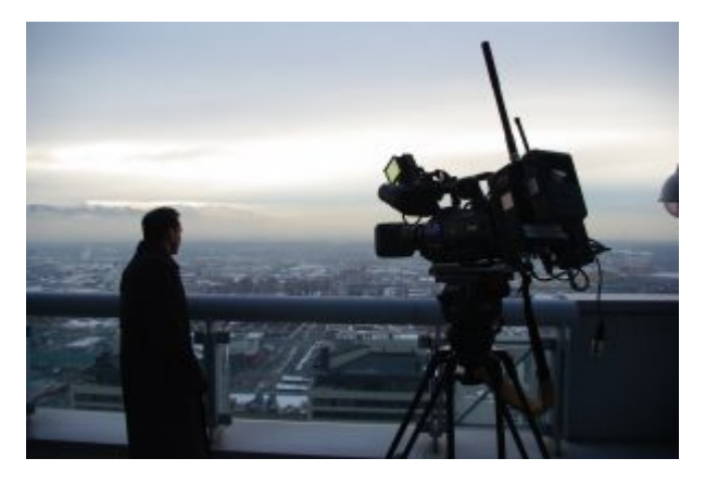
COFDM system going live 27 floors up on the top of the Salt Lake City Wells Fargo building.

COFDM stands for Coded Orthogonal Frequency Domain Multiplex, and don't worry, you don't need to know that. You should know it is a compact transmitter, small enough to attach to the back of the camera, and with a shorter range.