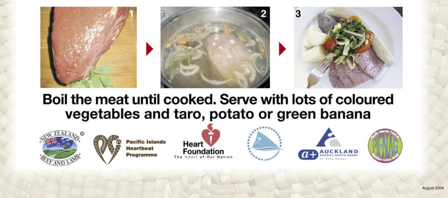
FIGURE 6 Making a Healthier Meal Using Povi/Pulu Masima & Brisket. Poster sponsored by New Zealand Beef and Lamb, the Pacific Islands Heartbeat Programme, the Heart Foundation, the Secretariat of the Pacific Community, the Auckland District Health Board, and the Pacific Islands Food and Nutrition Action Group, August 2004.

Alternatively, use the leaner cut of corned silverside shown below