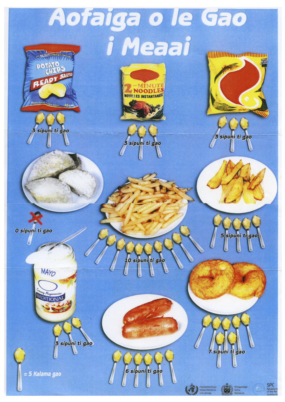
FIGURE 3 Aofaiga o le gao is meaai (Amount of fat in food). Poster sponsored by the World Health Organization, the Samoan Ministry of Health, and the Secretariat of the Pacific Community.