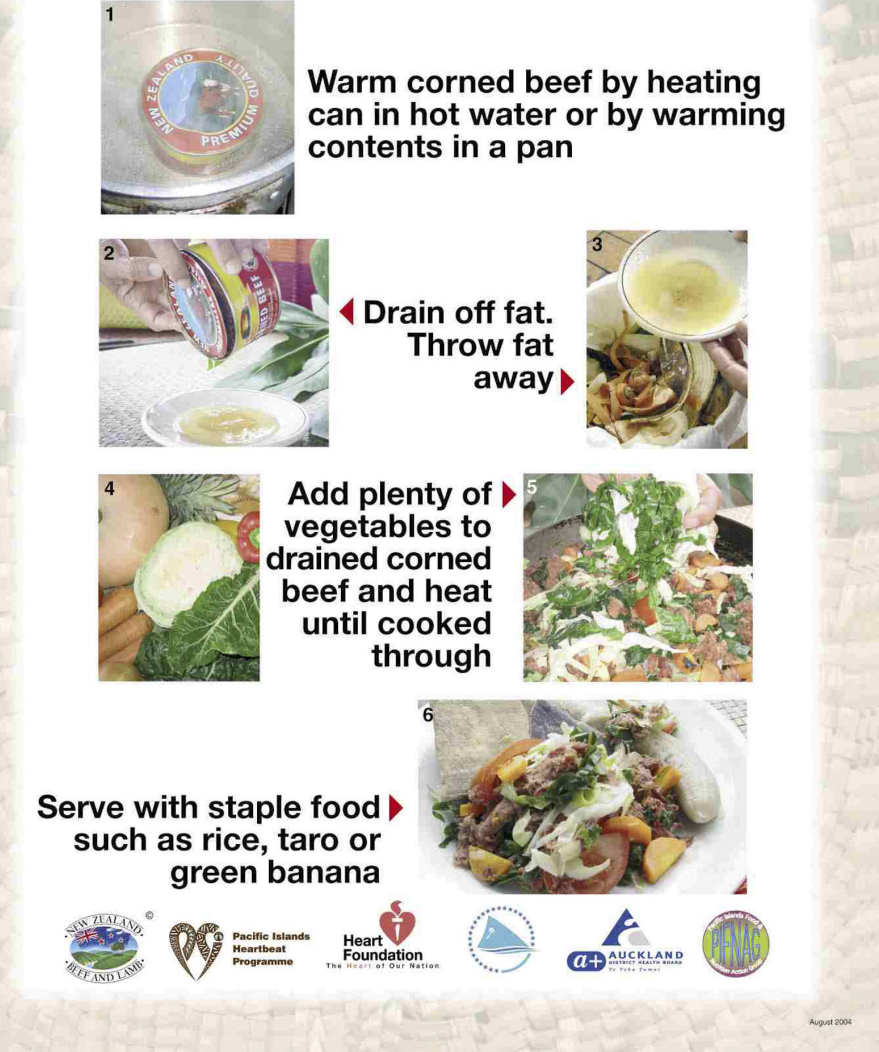
FIGURE 8 Making a Healthier Meal Using Corned Beef. Poster sponsored by New Zealand Beef and Lamb, the Pacific Islands Heartbeat Programme, the Heart Foundation, the Secretariat of the Pacific Community, the Auckland District Health Board, and the Pacific Islands Food and Nutrition Action Group, August 2004.