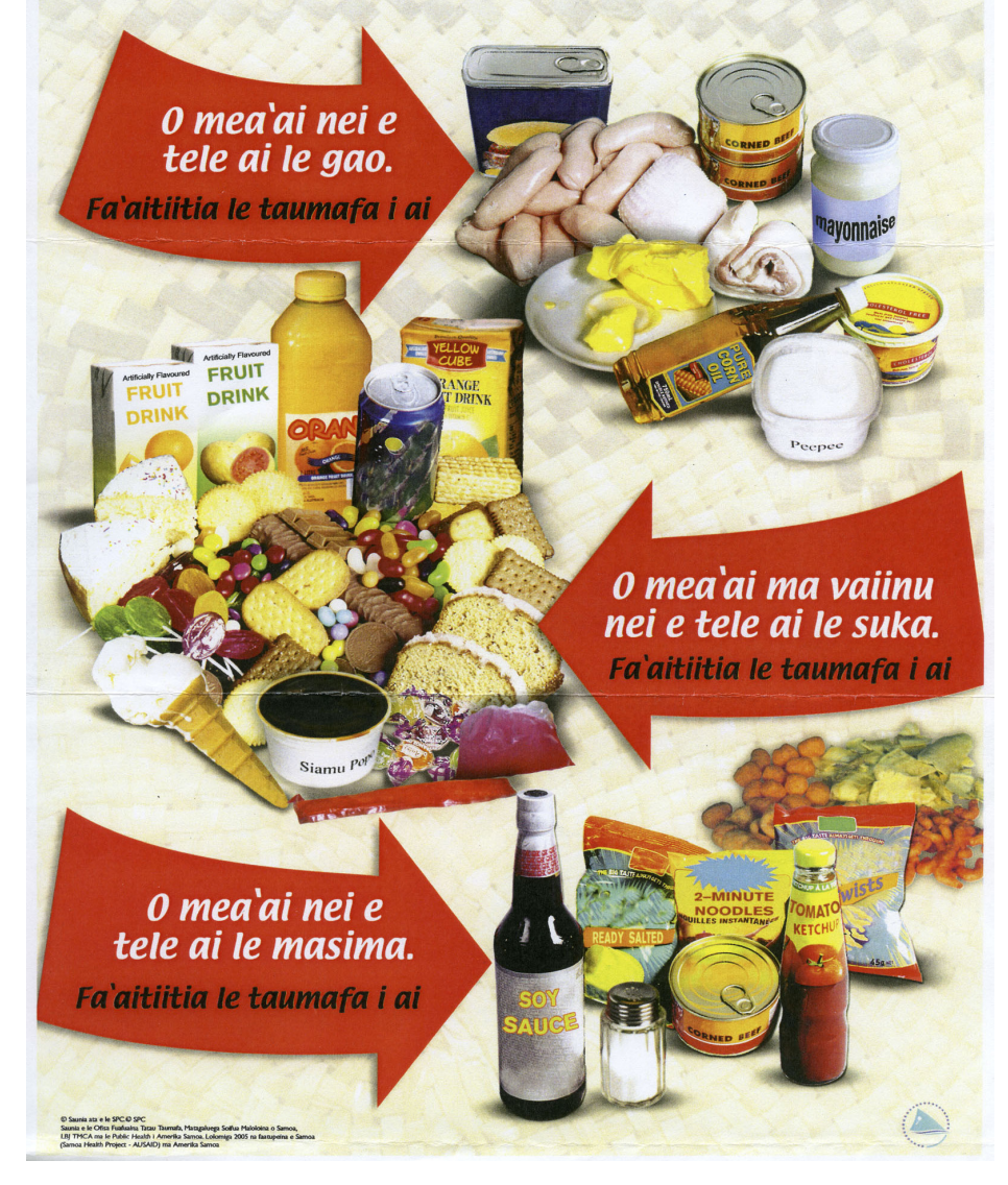
FIGURE 5 Fa'aitiitia le taumafa i mea'i nei mo lou soifua maloloina (Decrease your consumption of these types of food for your health). Poster sponsored by the Secretariat of the Pacific Community, 2005.