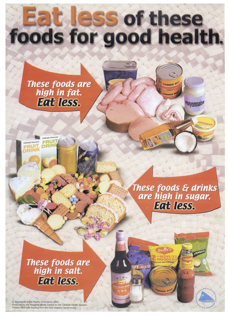
FIGURE 4 Eat Less of These Foods for Good Health. Poster sponsored by the Secretariat of the Pacific Community, 2002.