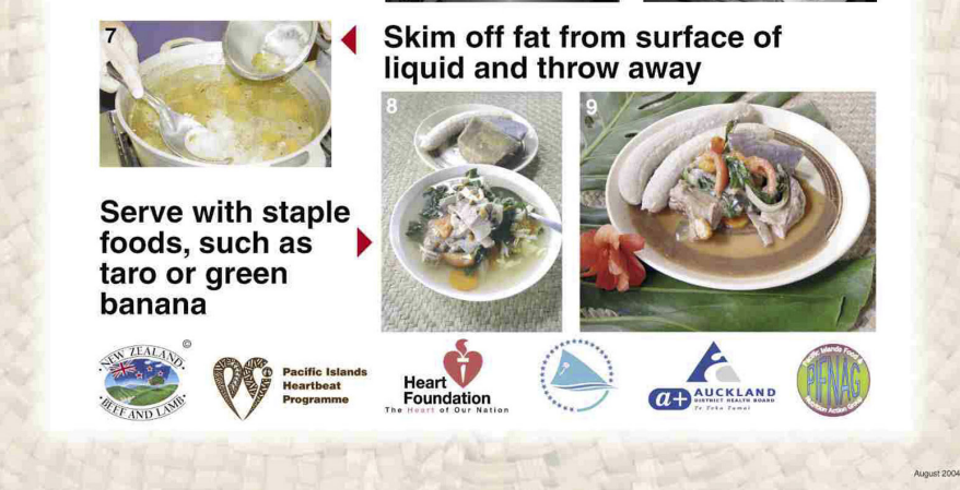
FIGURE 7 Making a Healthier Meal Using Mutton Flaps. Poster sponsored by New Zealand Beef and Lamb, the Pacific Islands Heartbeat Programme, the Heart Foundation, the Secretariat of the Pacific Community, the Auckland District Health Board, and the Pacific Islands Food and Nutrition Action Group, August 2004.