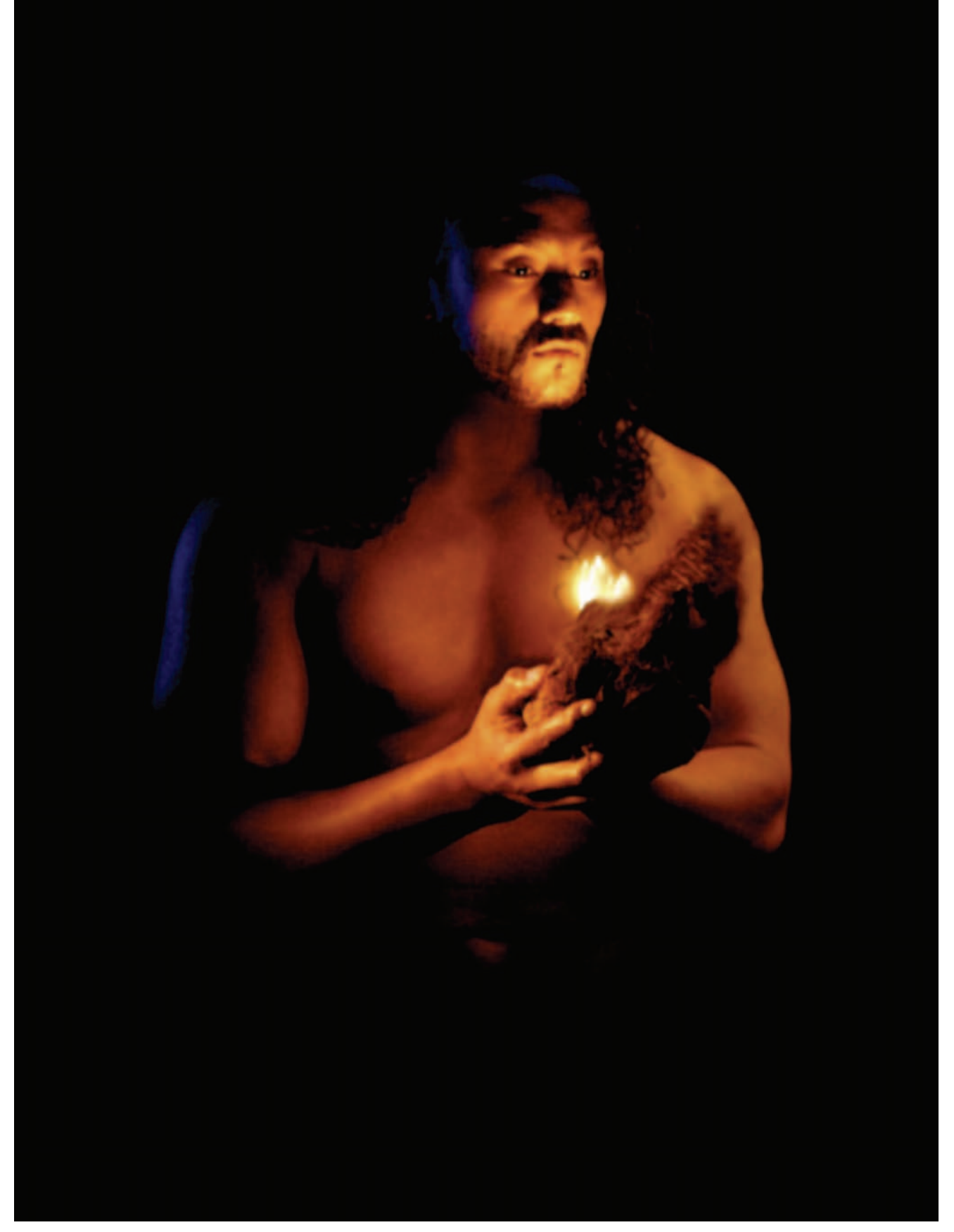
Figure. 14.5. Maui Ti'eti'e Talaga; Maui and the first fire of Samoa , 80cm x 60cm, Mixed media and Photography. Courtesy of Photographer S. Coyle and Artist S. Kihara.