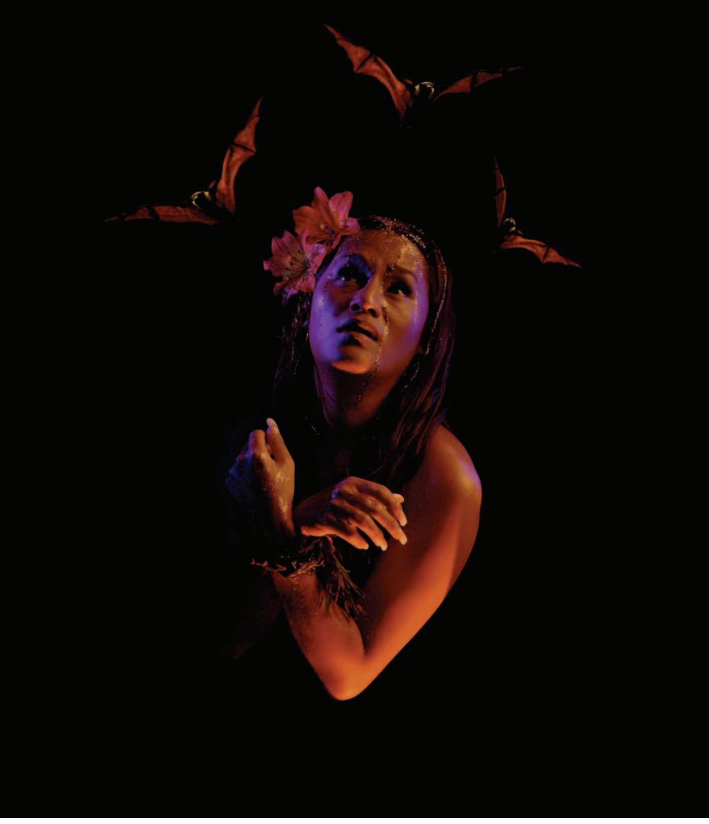
Figure. 14.3. Tonumaipe'a; How she was saved by the bat , 80cm x 60cm, Mixed media and Photography. Courtesy of Photographer S. Coyle and Artist S. Kihara.