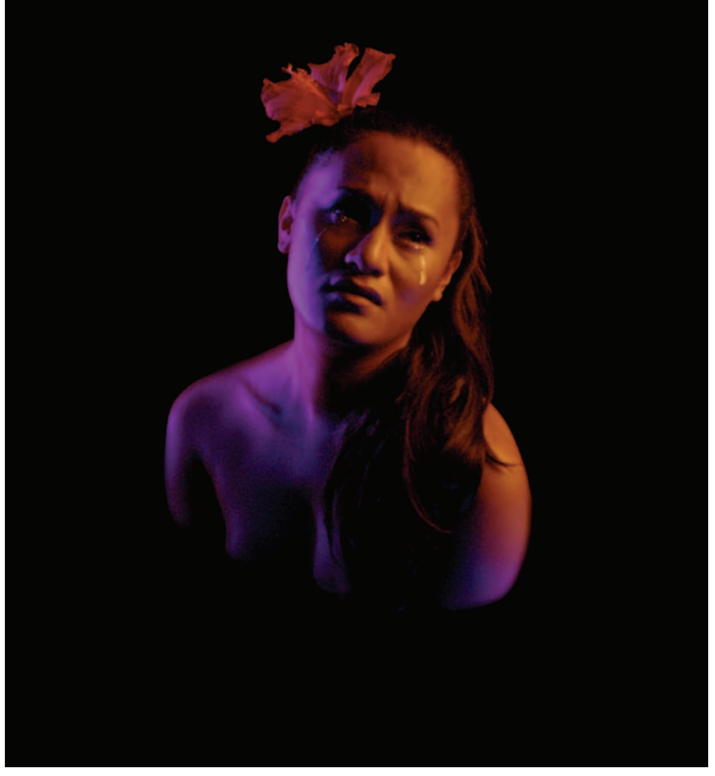
Figure. 14.2. Le loimata o Apaula; Tears of Apaula (Dip tyck), 80cm x 60cm, Mixed media and Photography. Artist S. Kihara.