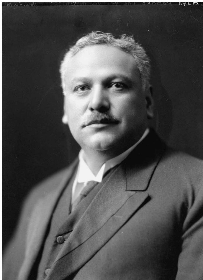
FIGURE 1: Sir Maui Wiremu Pomare photographed by S P Andrew Ltd, Wellington, Alexander Turnbull Library, Ref: 1/1-019098-F.

was scarce. 5 The Maui Pomare was also to carry people, mail and other goods between New Zealand and Western Samoa, Niue and Norfolk Island (an Australian territory included in this vessel's run as it was a base for New Zealand's Melanesian Mission). 6 The Maui Pomare's initial run linked the islands of Upolu, Niue and Norfolk to the ports of Lyttelton, Wellington and Auckland. Dunedin was initially slated to be