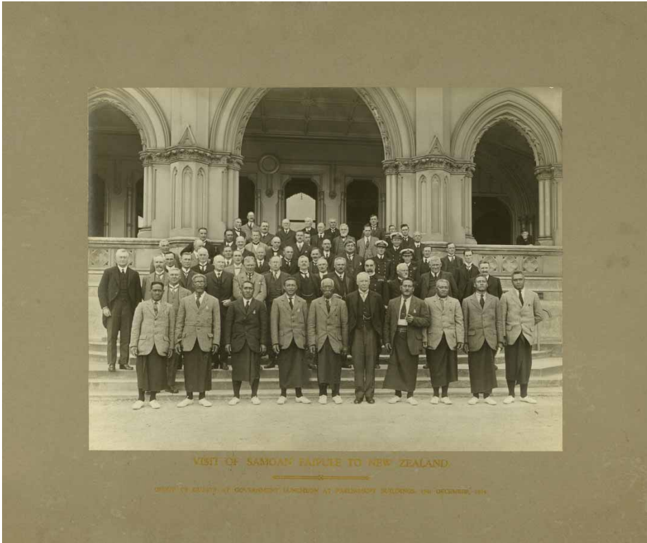
FIGURE 2: 'Photograph of visit of Samoan faipule to New Zealand. Group of guests at government luncheon at parliament buildings, 15th December, 1924', ANZ IT9 box 21 7/19. An illustrated article in the Auckland Weekly News makes it possible to identify the names or titles of the faipule who are flanking Sir Francis Bell in the front row, L to R: Va'ai, Toelupe, Ama, Leilua, Aiono, Bell, Fonoti, Tapuosa, I'iga Pisa, Ainu'u Tasi. See A.J. Tattersall, 'Wise men of Samoa who are on a visit to New Zealand to learn the white man's ways', Auckland Weekly News , 11 Dec. 1924.