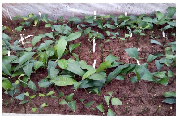
Figure 2. Unrooted cuttings of Garcinia kola planted in non-mist poly-propagator.