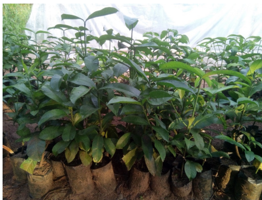
Figure 5. Seedlings of G. kola regenerated in non-mist poly-propagator by stem cuttings and acclimatized in shade nursery.

ability due to their more food reserves in these cuttings. According to [38], the sprouting of cutting depends on food reserves available within the cuttings in vegetative propagation.