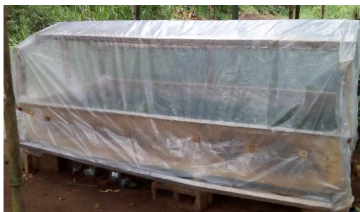
Figure 3. Closed non-mist poly-propagator containing cuttings and placed under shade.

Over a period of 180 days after planting the cuttings, assessments were made on cuttings viability percentage (cuttings remained green and alive, or dead); the percentage of sprouting and rooting, the sprouting and leafing emergence time, the number of primary roots, the length of shoot and the longest root per cutting. Cuttings were considered rooted or sprouted when they have one root or bud exceeding 0.5 cm in length. To facilitate rooting evaluation, rooted cuttings were taken from substrate carefully and sand was removed. Sprouting was assessed every two days, while rooting was assessed at monthly intervals. Final mean data/percentages were calculated at the end of the experiment.