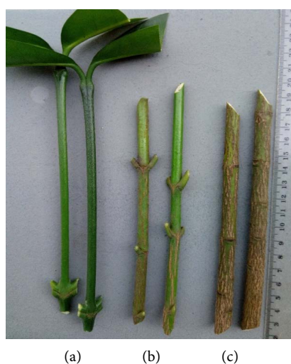
Figure 1. Different types of Garcinia kola cuttings used for propagation; greenwood leafy cuttings with 25% of leaf area (28.5 cm 2 ) (a), softwood leafless cuttings (b), hardwood leafless cuttings (c).

Two factors were tested 1) the cutting type (greenwood, softwood and hardwood) and 2) leaf area (0, 28.25, 56.5, 84.75 and 113 cm 2 ). Fifteen treatments were applied (3 cutting types × 5 leaf areas). For each treatment, 60 cuttings were arranged in three replicates (20 cuttings per replicate). Cuttings were inserted to a depth of 3 cm in the rooting media with a spacing of 5 cm from each other (Figure 2). After planting, cuttings were watered and the non-mist poly-propagator was covered with clear polythene to maintain high humidity around the cuttings and allow the penetration of light into the propagator (Figure 3). The average temperature and relative humidity registered in the non-mist poly-propagator were 28°C ± 2°C and 94%, respectively. The cuttings were sprayed with a fine mist of water once per week because of the high moisture content in this non-mist poly-propagator.